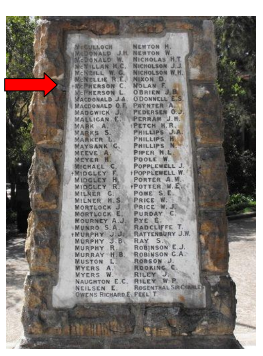
Sutherland War Memorial