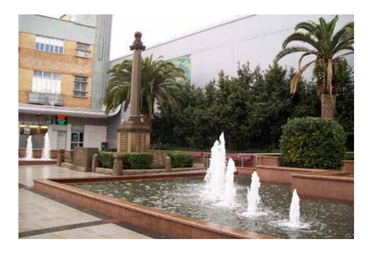
Hurstville War Memorial