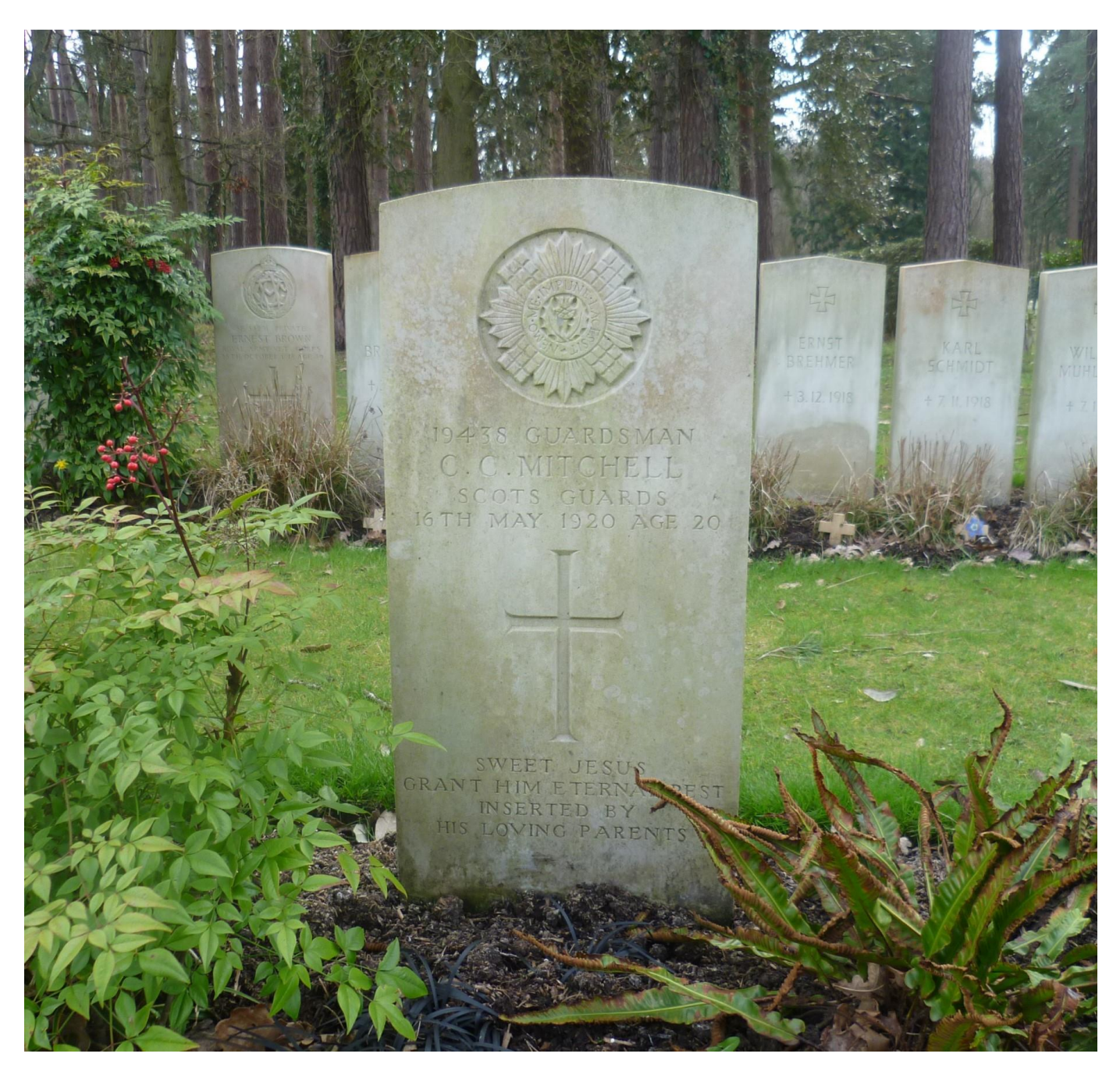
Photo of Guardsman C. C. Mitchell's Commonwealth War Graves Commission Headstone in Brookwood Military Cemetery, Surrey, England.