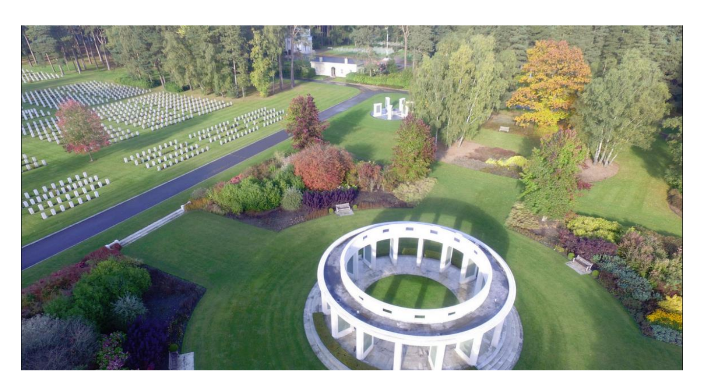
Brookwood Military Cemetery