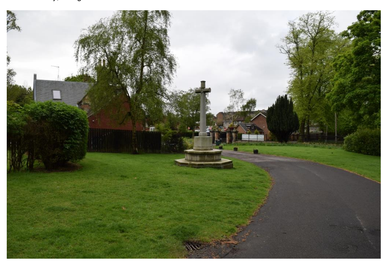
Cross of Sacrifice, Cathcart Cemetery, Glasgow

Cathcart Cemetery, Glasgow contains 242 War Graves – 143 from World War 1 & 99 from World War 2.