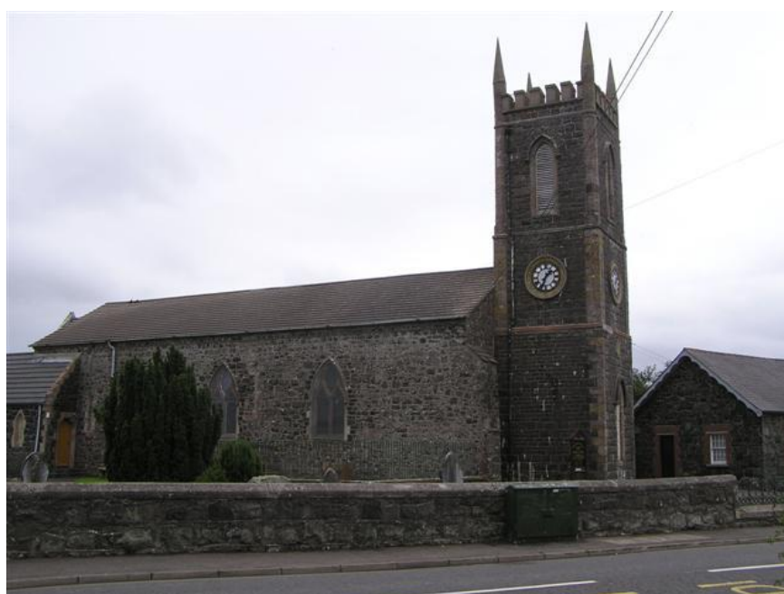
St. Mary's Church of Ireland Church, Macosquin

St. Mary's Church of Ireland Churchyard, Macosquin, Northern Ireland contains 4 Commonwealth War Graves – 3 from World War 1 & 1 from World War 2. There is only 1 Australian Forces burial.