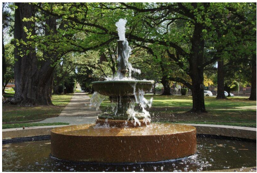
Armidale Memorial Fountain