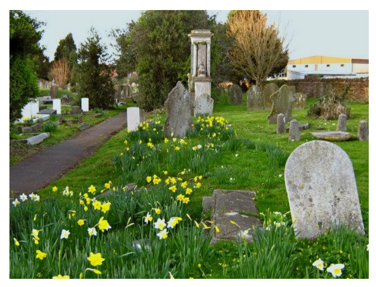
Wembdon Road Cemetery, Bridgwater

There are 35 Commonwealth War Grave Commission burials – 28 from World War 1 & 7 from World War 2.