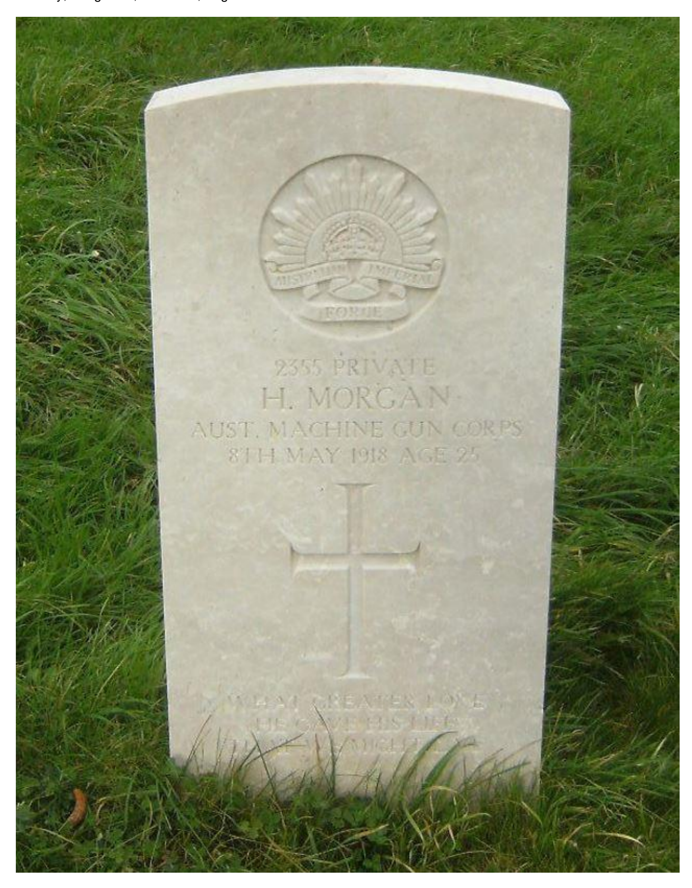
Photo of Private H. Morgan's <u>New Commonwealth War Graves Commission Headstone in Wembdon Road Cemetery</u>, Bridgwater, Somerset, England.