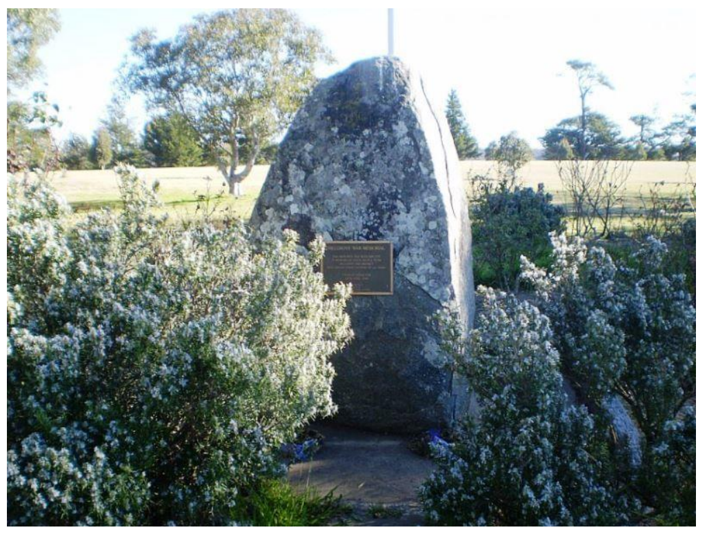
Hillgrove War Memorial

The Hillgrove War Memorial, located at Bracken & Wood Streets, Hillgrove, NSW does not list individual names.