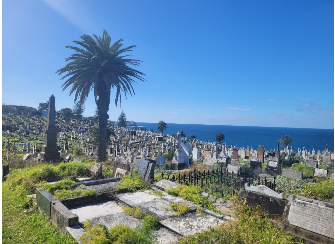
Waverley Cemetery