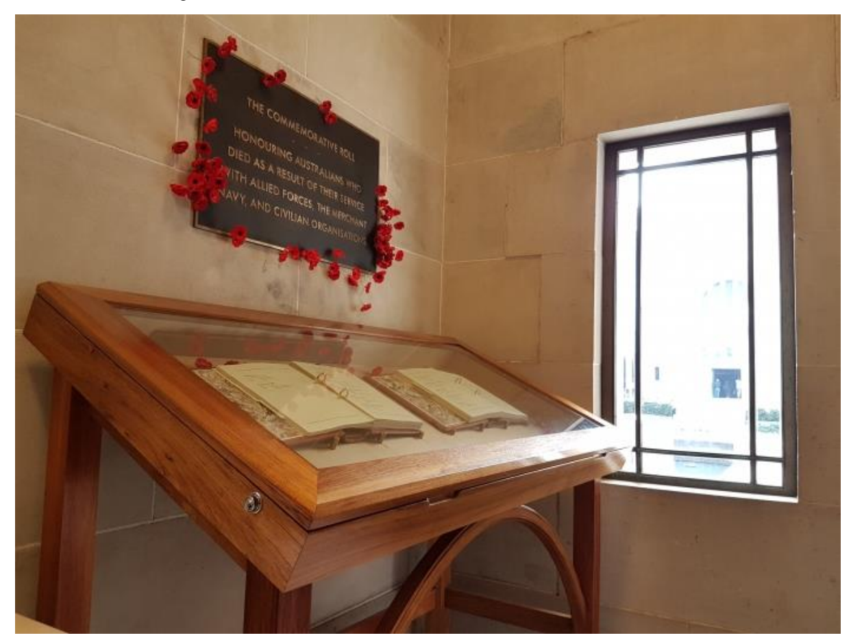
Commemorative Roll