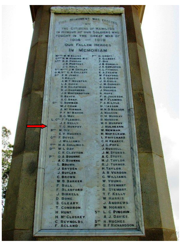
Hamilton War Memorial