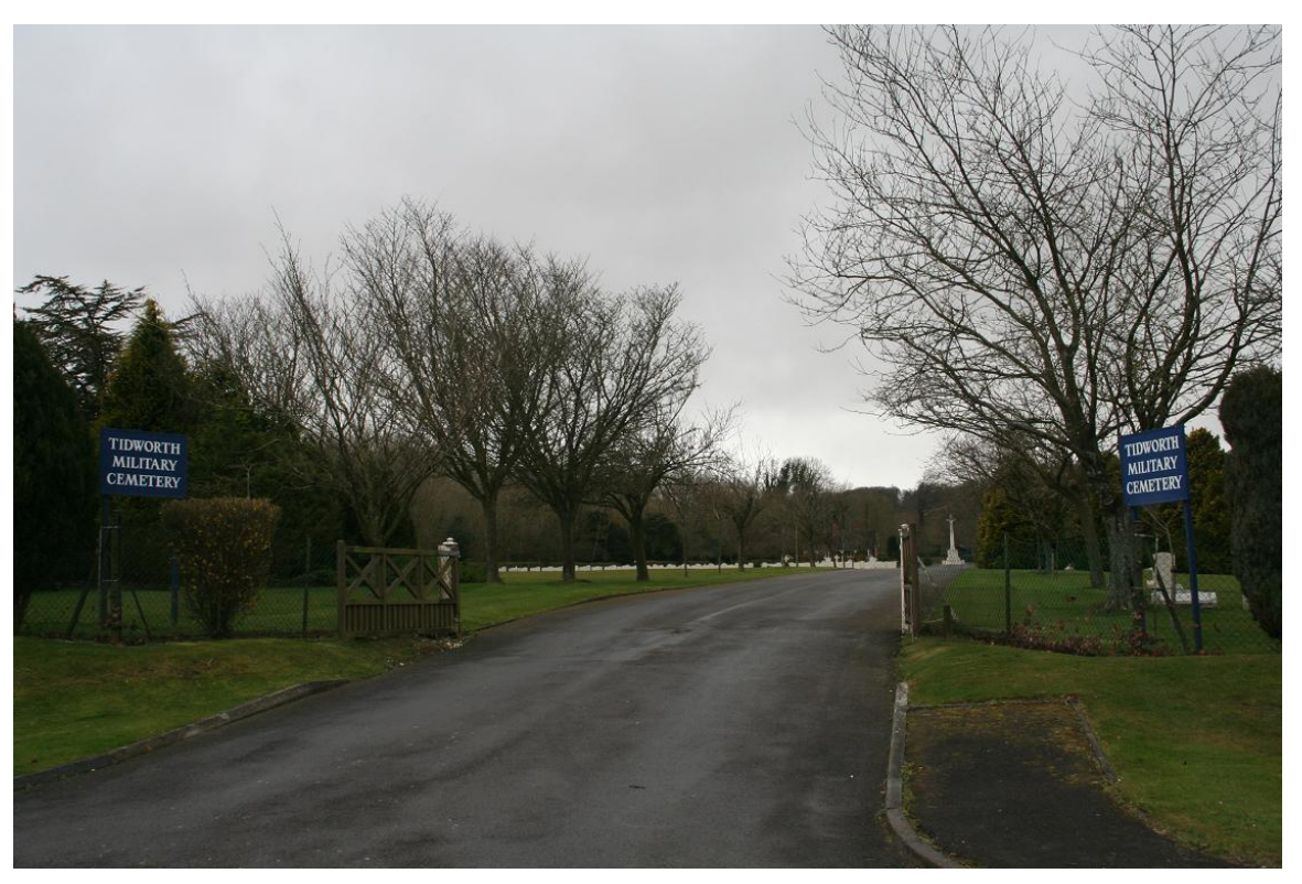
Tidworth Military Cemetery