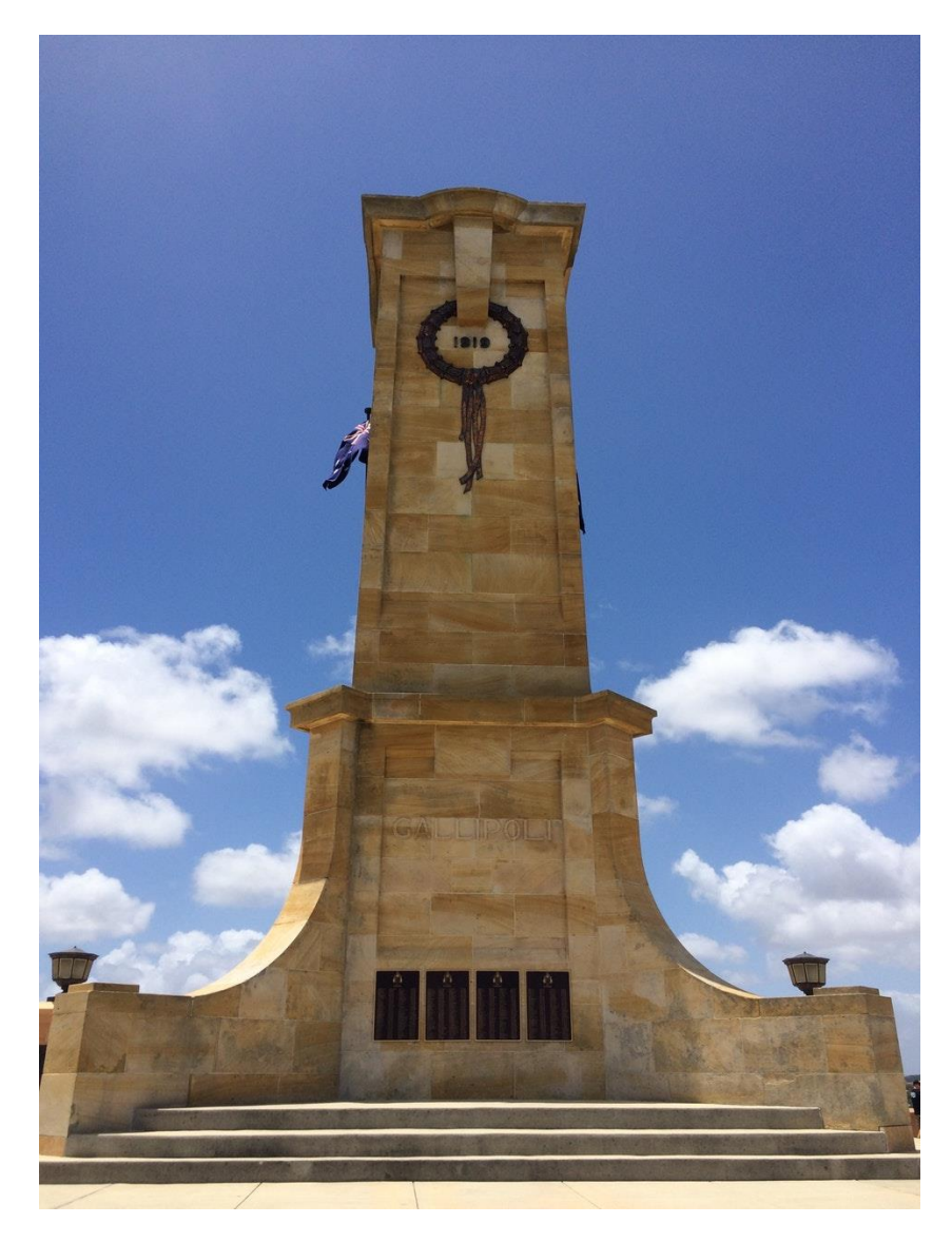
Fallen Sailors & Soldiers Memorial