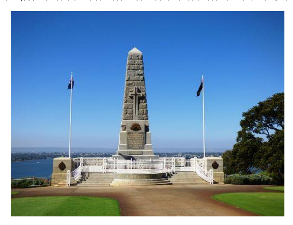
Western Australia State War Memorial Cenotaph, Kings Park (above) & (below) The Crypt with the Roll of Honour names

The heavy concrete foundations are supplemented by heavy brick walls which enclose an inner chamber or crypt. The walls surrounding the crypt are covered with The Roll of Honour; marble tablets which list under their units the names of more than 7,000 members of the services killed in action or as a result of World War One.