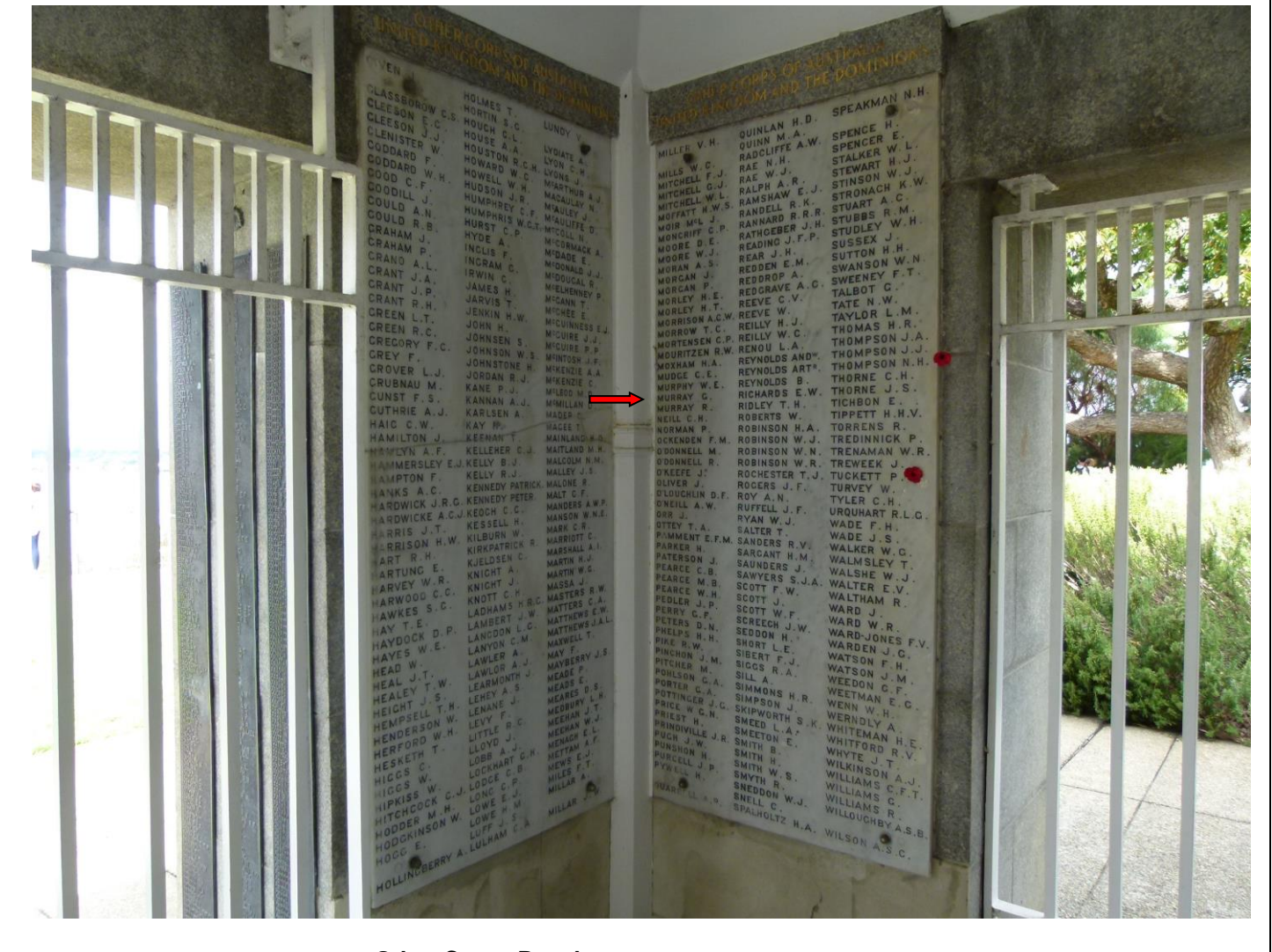
Other Corps Panel

G. Murray is remembered on Fremantle's 849, located at War Memorial, Monument Hill Memorial Reserve, High & Swanbourne Streets, Fremantle, Western Australia. Twelve plaques contain all 849 names of the Fremantle servicemen who died in service or were killed in action during World War One. The plaques were created as part of the Centenary of Anzac commemorations.