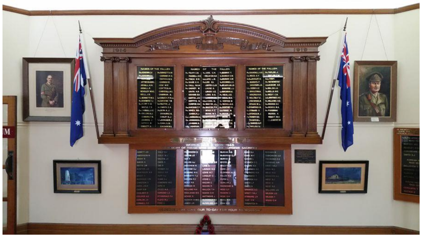
Orange WW1 Honour Board