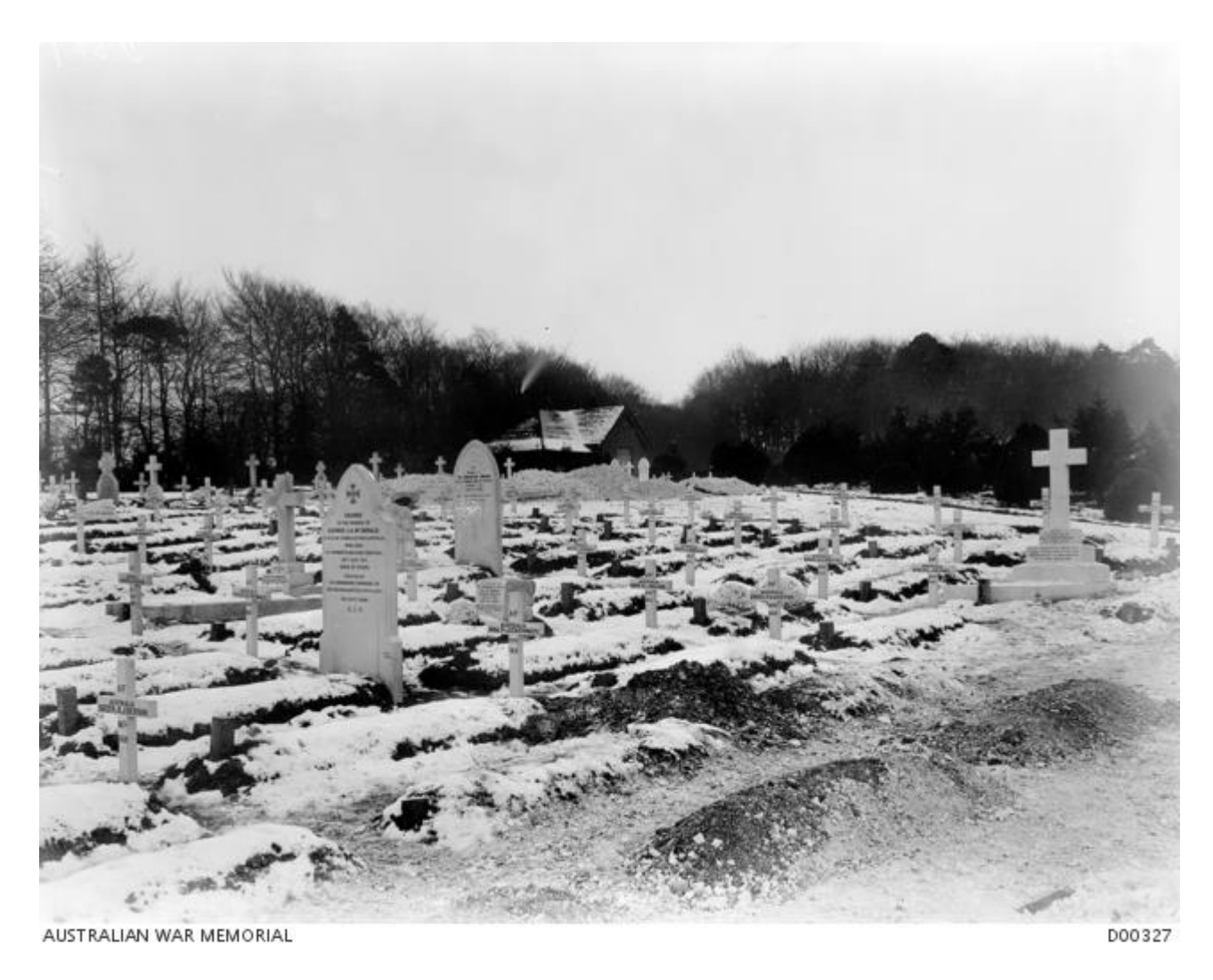
The AIF Tidworth cemetery under snow. – March 1919.

Identified graves marked by a cross and headstone in the foreground