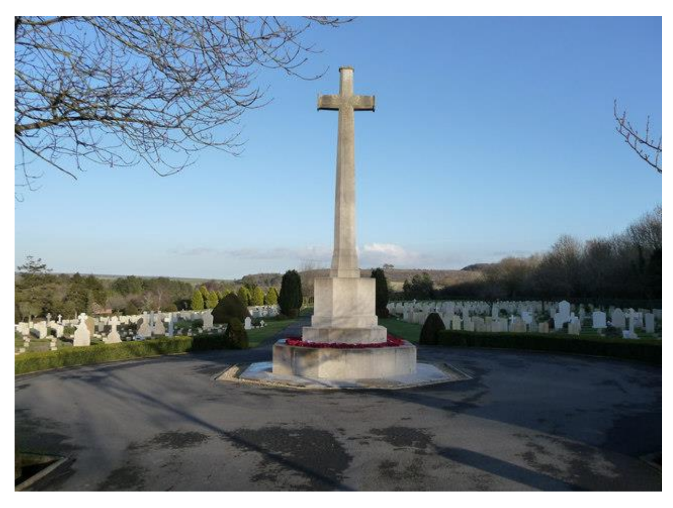
Tidworth Military Cemetery, Wiltshire