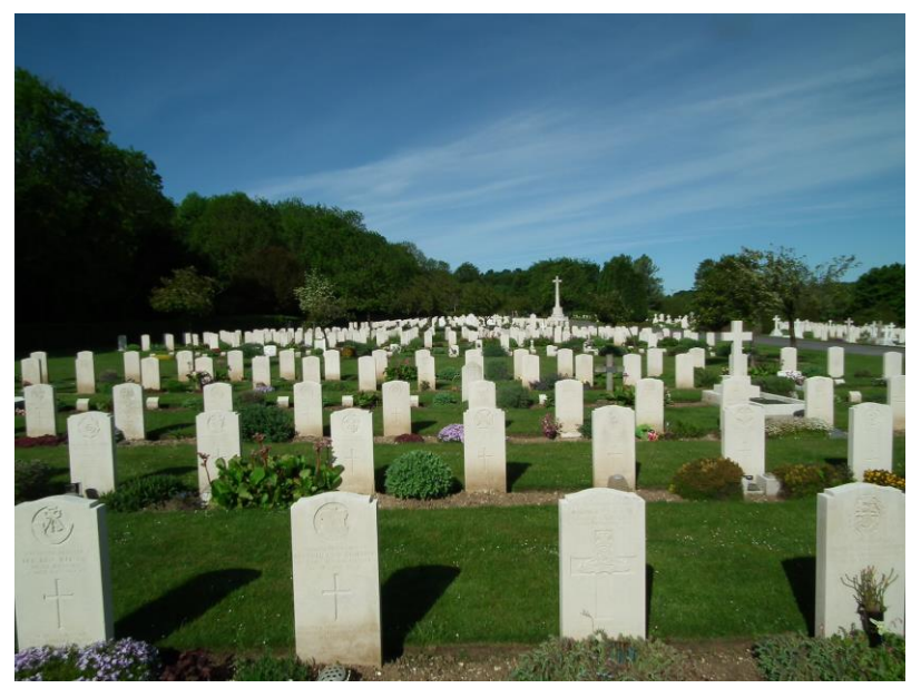
Tidworth Military Cemetery, Wiltshire