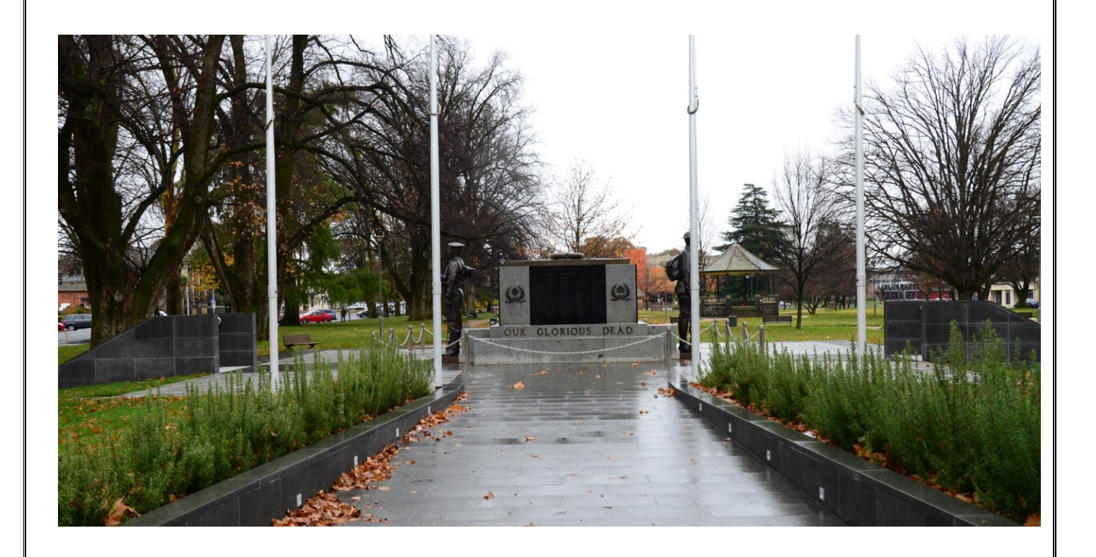
Orange Cenotaph