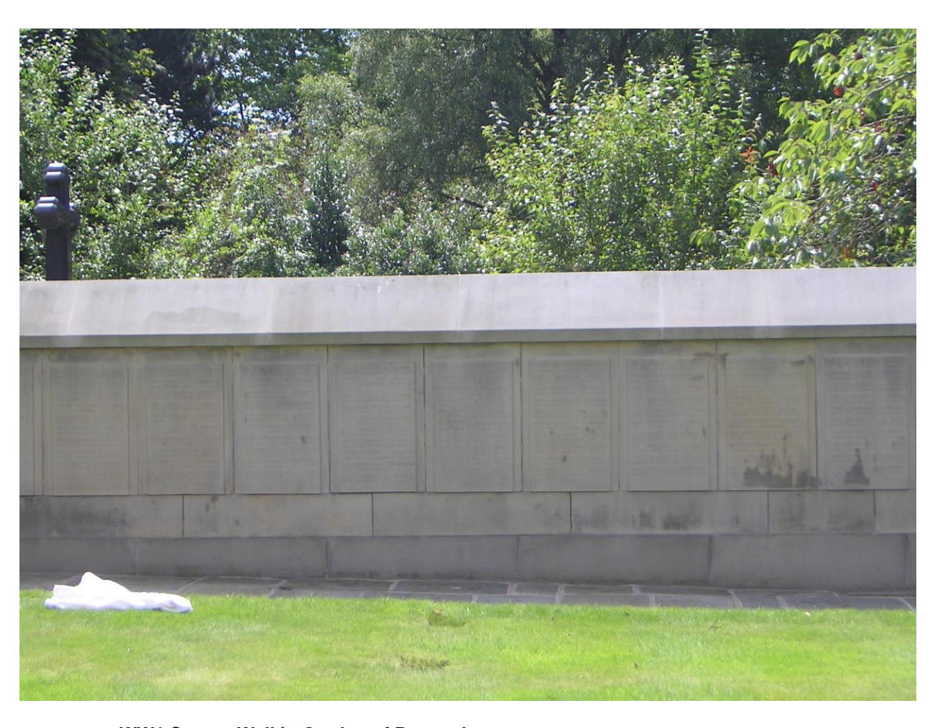
WW1 Screen Wall in Garden of Remembrance