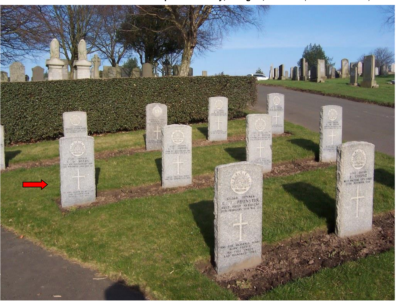
Some of the Australian Headstones in Western Necropolis Cemetery, Glasgow, Scotland Pte C. D. Myer's headstone shown with red arrow