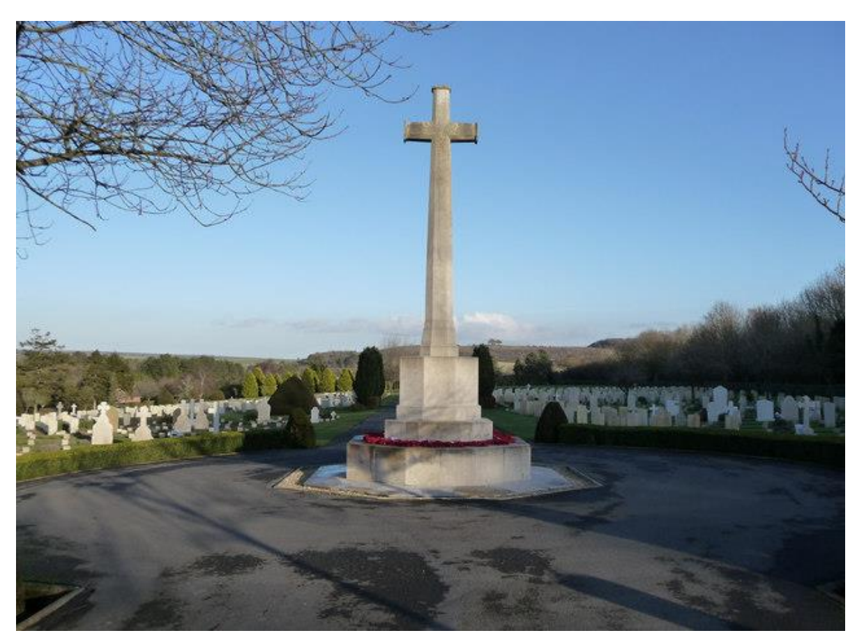
Tidworth Military Cemetery, Wiltshire