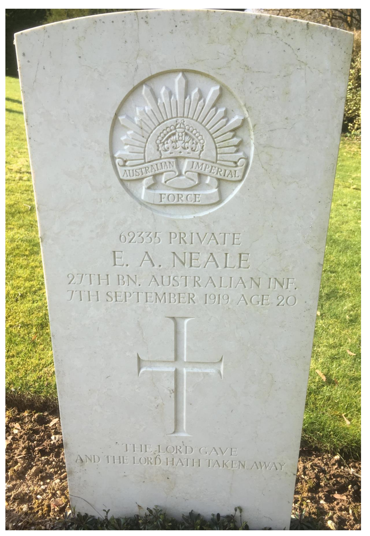
Photo of Private E. A. Neale's Commonwealth War Graves Commission Headstone in Tidworth Military Cemetery, Wiltshire, England.