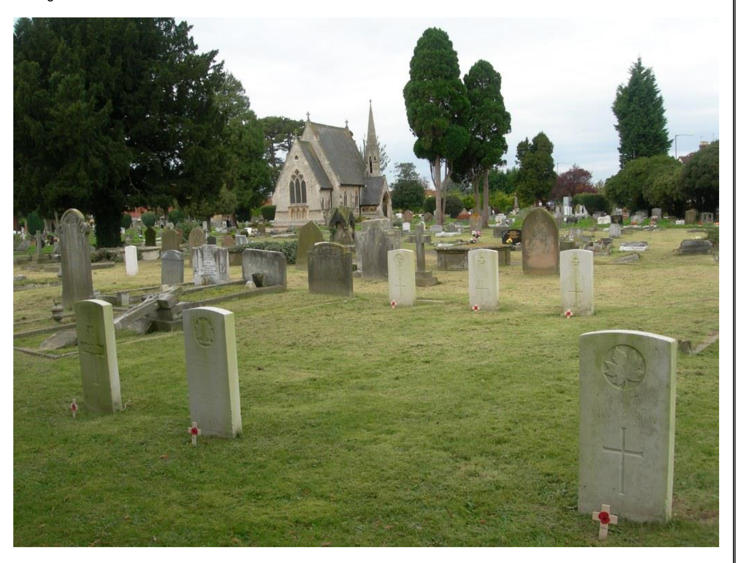
Tring Road, Cemetery, Aylesbury, Buckinghamshire

Tring Road, Cemetery, Aylesbury, Buckinghamshire contains 107 War Graves from both World Wars, 3 of these belong to Australian Air Mechanics 2<sup>nd</sup> Class.