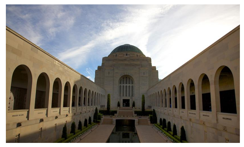
Commemorative Area of the Australian War Memorial