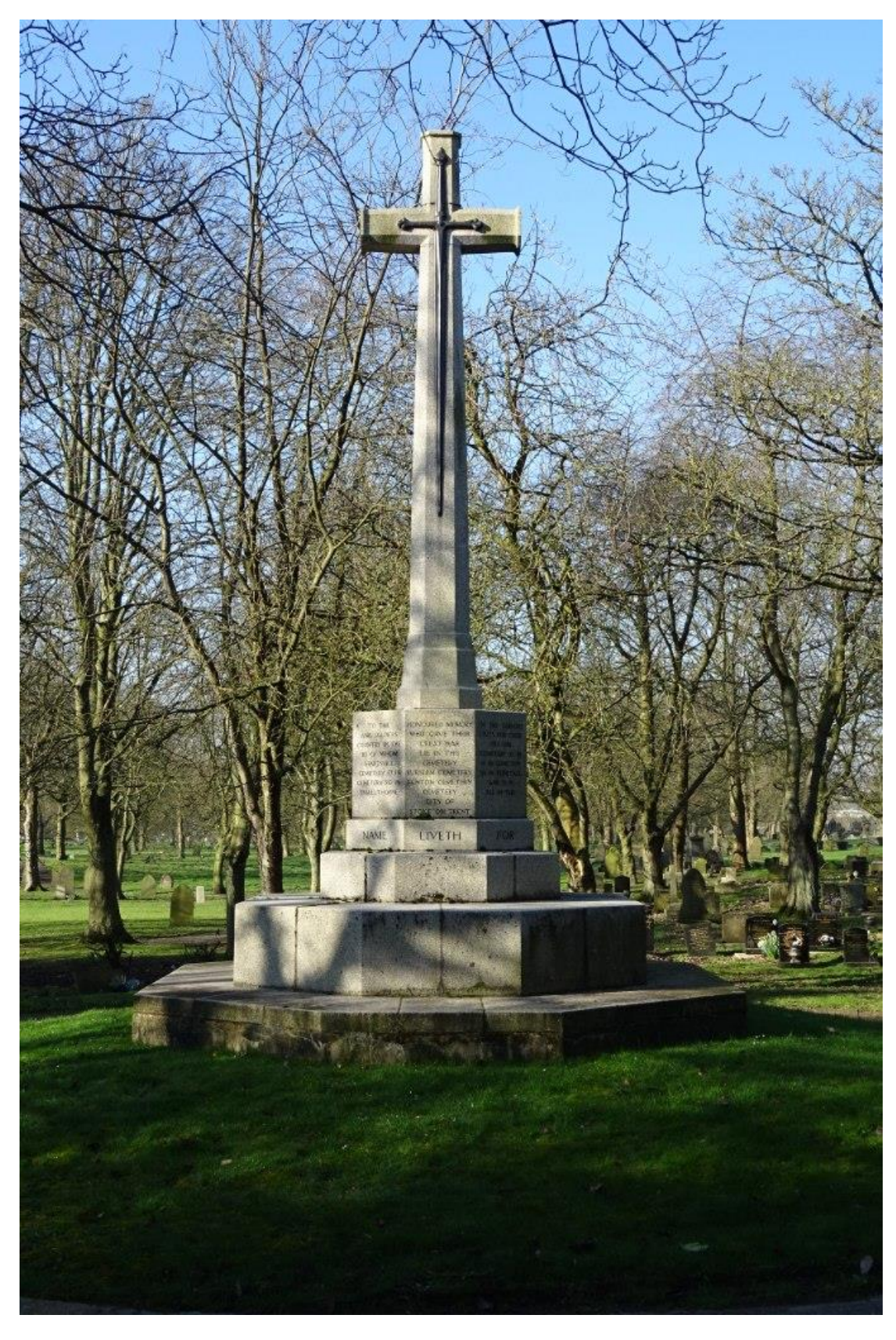
Cross of Sacrifice in Hanley Cemetery