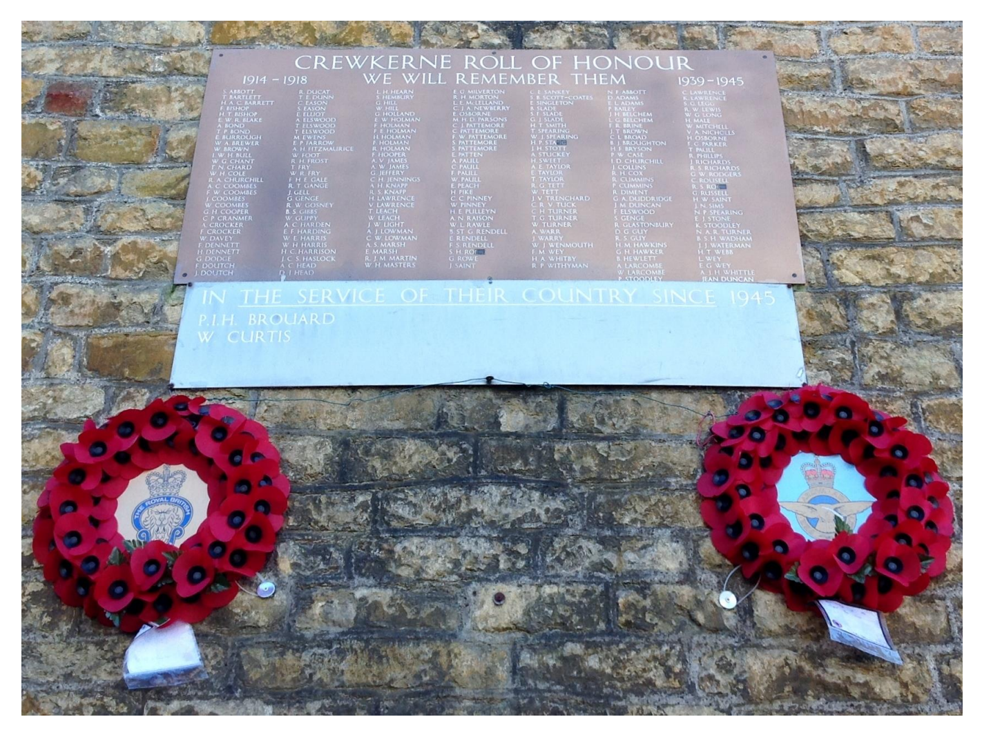
Crewkerne Memorial Plaque