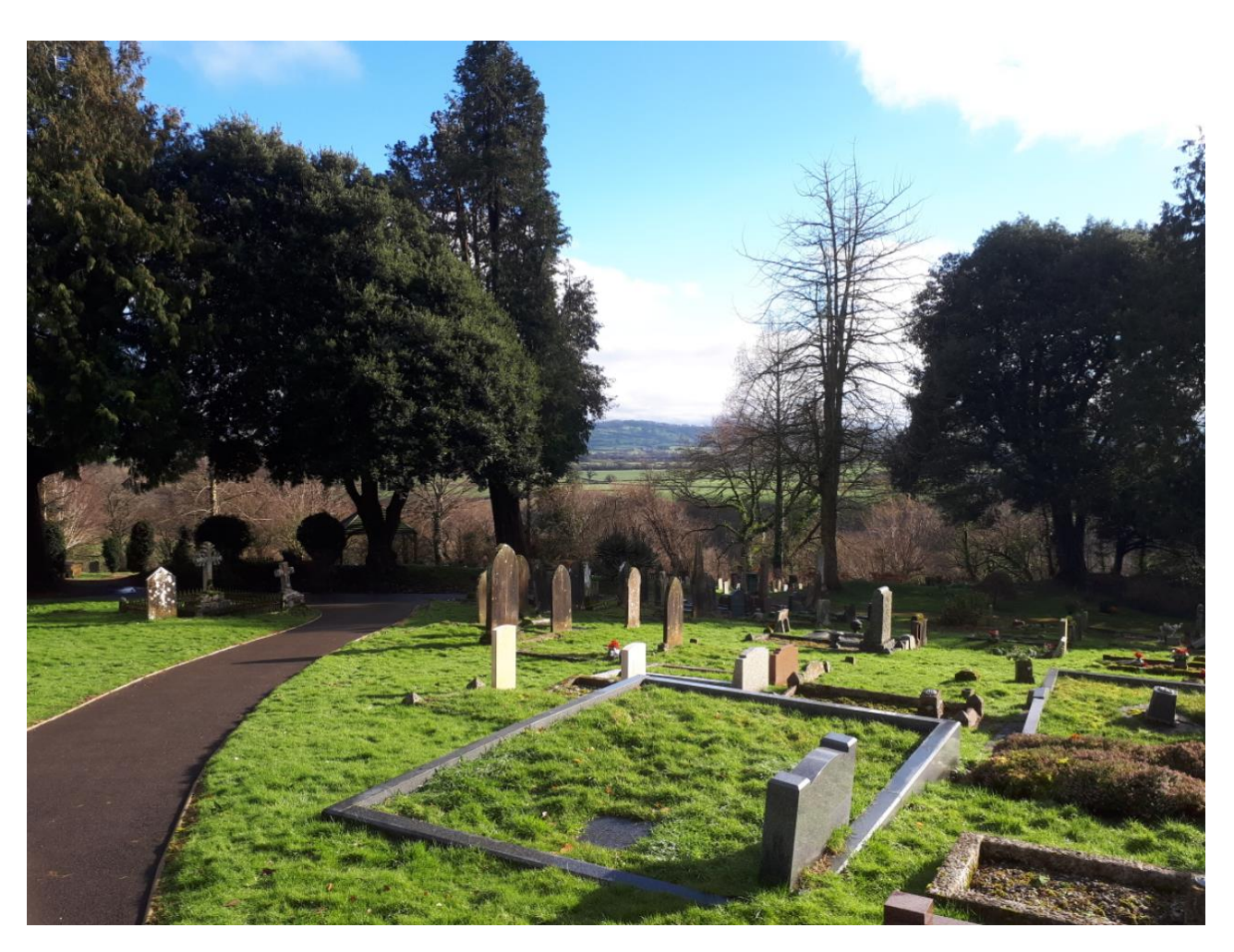
Townsend Cemetery, Crewkerne