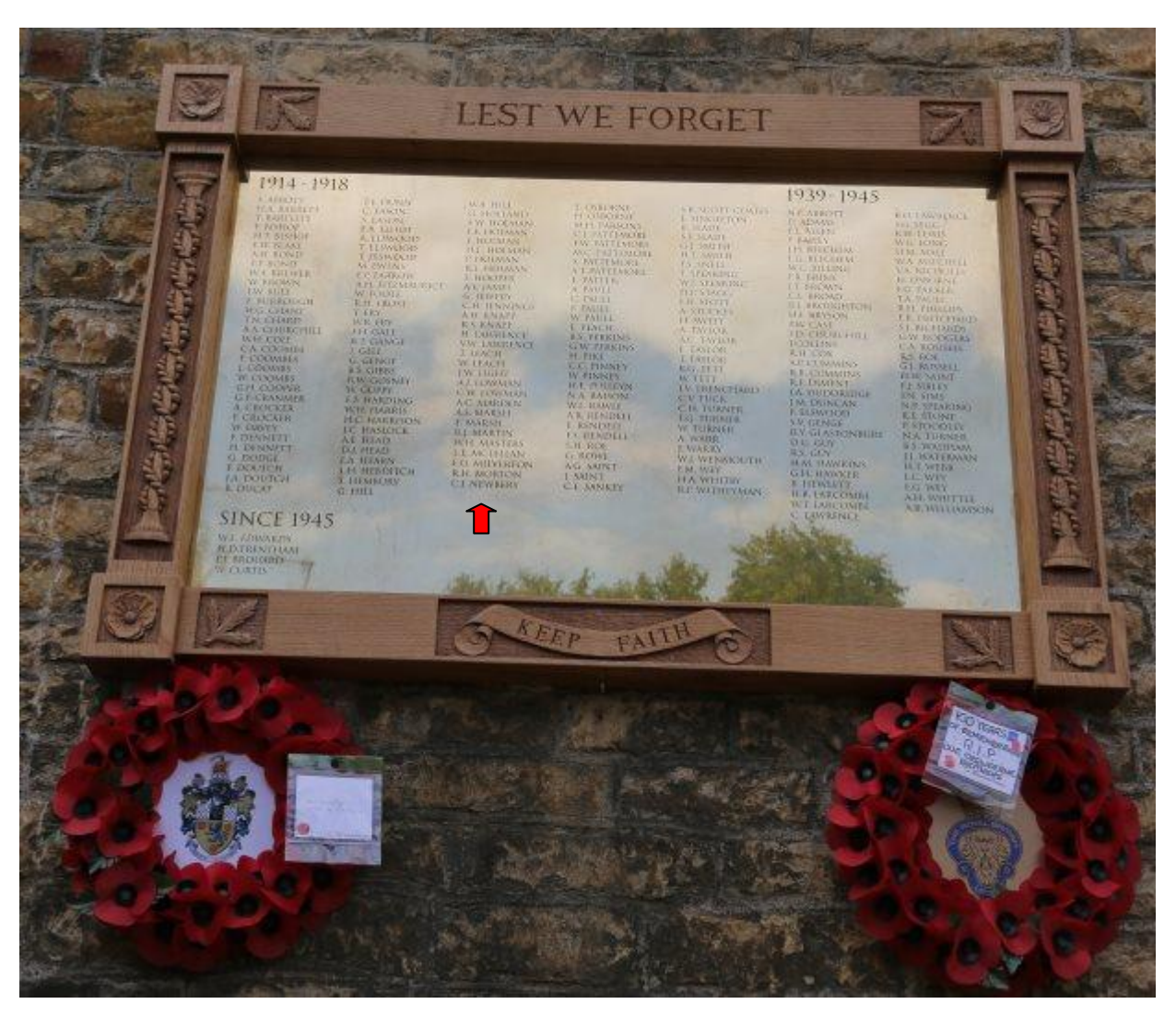
Crewkerne New Memorial Plaque

C. J. Newbery is remembered on the new Crewkerne Memorial Plaque, located Falkand Square, Crewkerne, Somerset, England. (Column 3, last name)