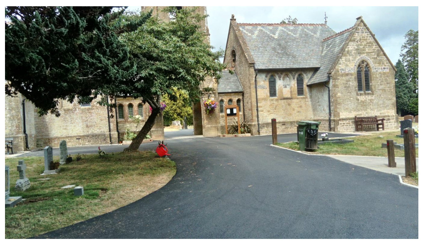
Chapel at Townsend Cemetery, Crewkerne