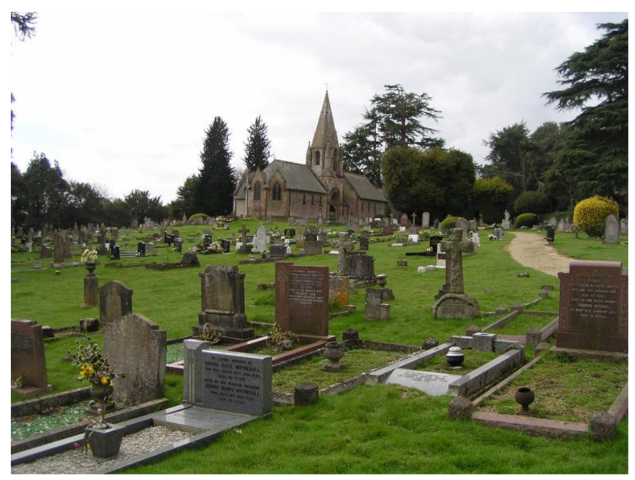
Townsend Cemetery, Crewkerne

Townsend Cemetery, Crewkerne, contains 19 Commonwealth War Graves – 10 from World War 1 & 9 from World War 2.