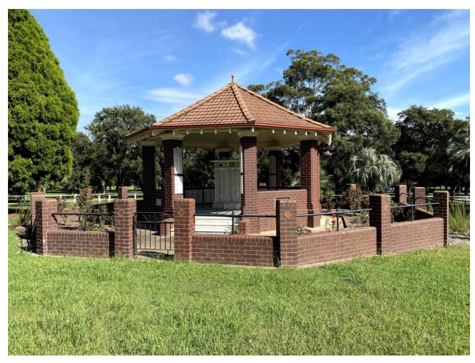
Concord Pavilion of Honour