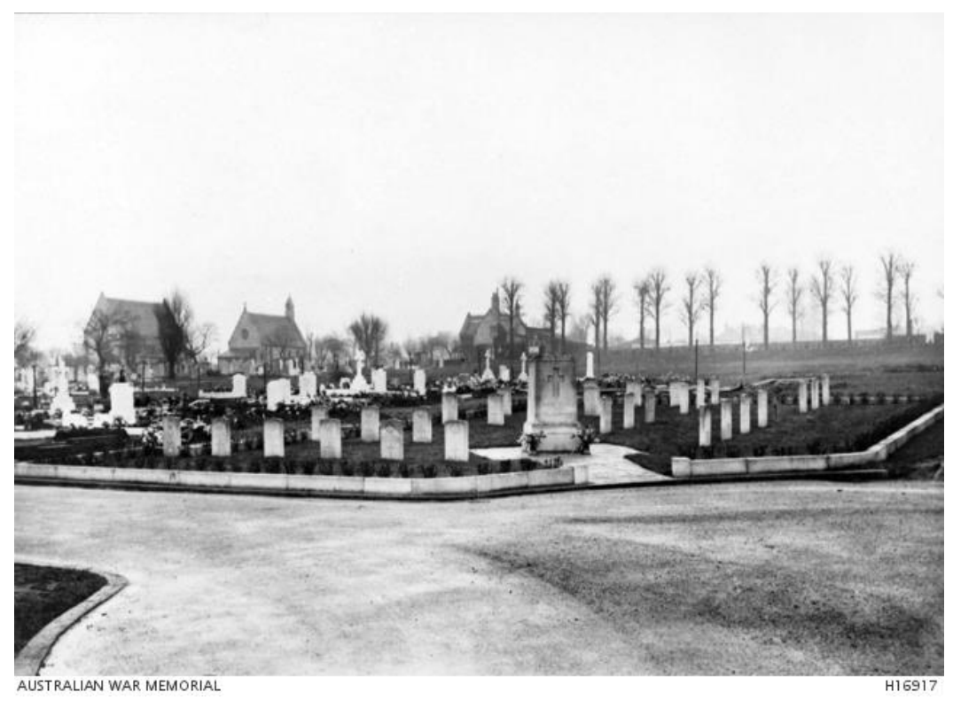
A group of Soldiers' graves in the Australian Section of Wandsworth Cemetery, London (taken 15 April, 1931)

There are 34 Australian World War 1 Soldiers buried here & 1 Australian Soldier from 1925. (Information from CWGC)