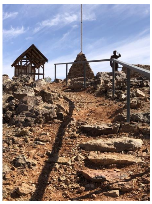
Farina War Memorial