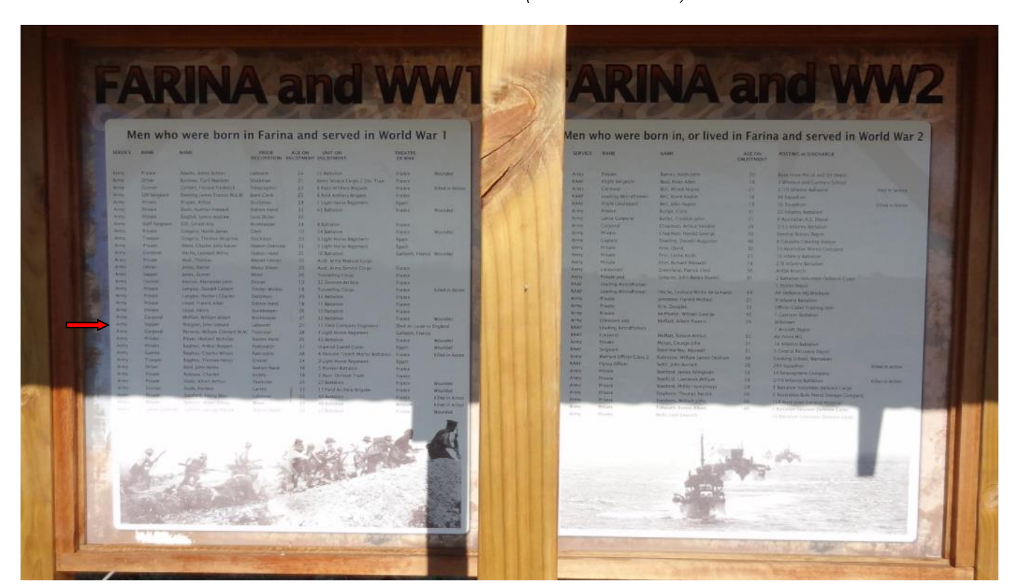
Farina War Memorial