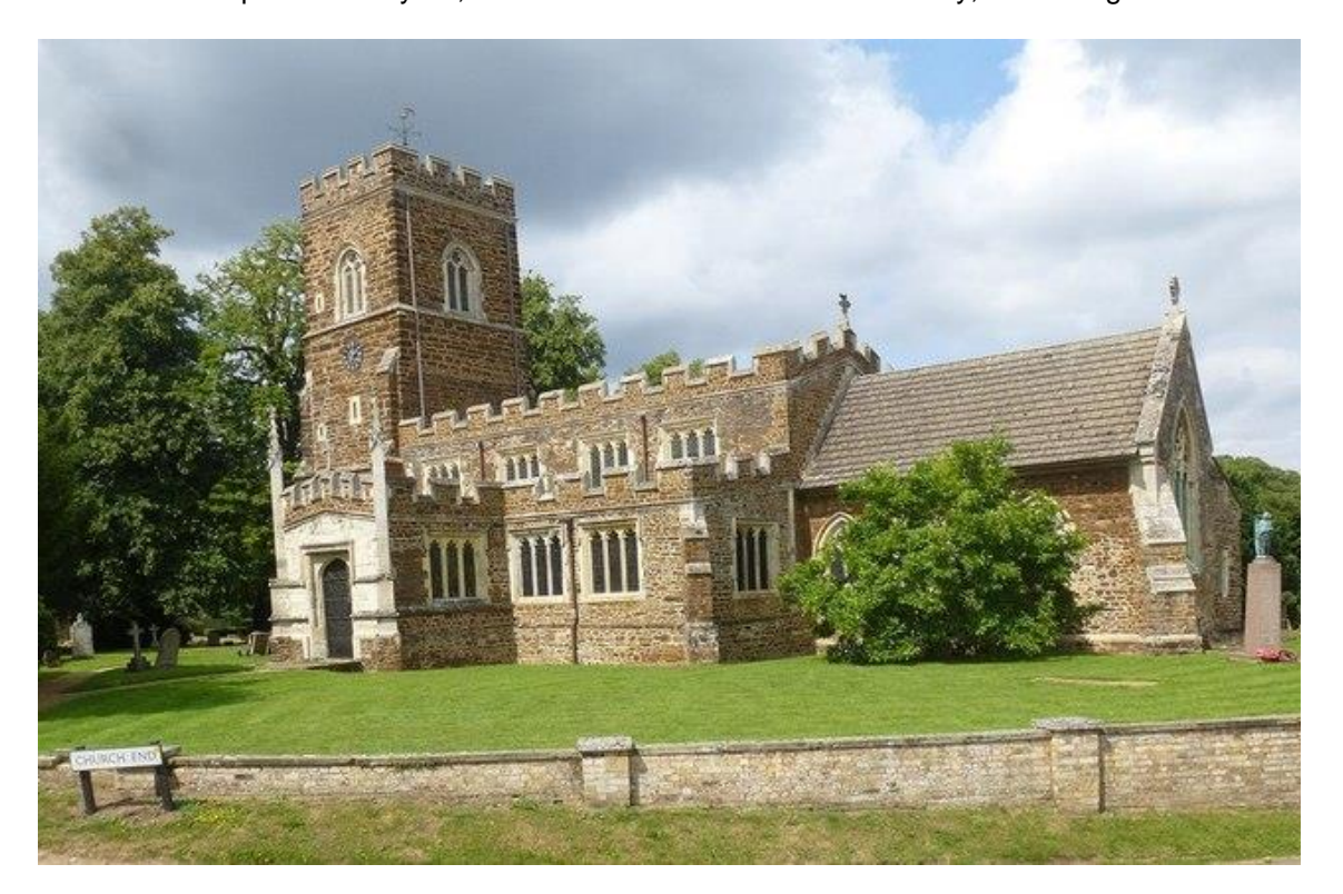
St. John the Baptist Church

St. John the Baptist Churchyard, Eversholt contains 4 War Graves only, all relating to World War 1.