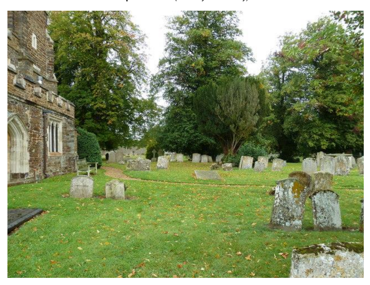
St. John the Baptist Churchyard