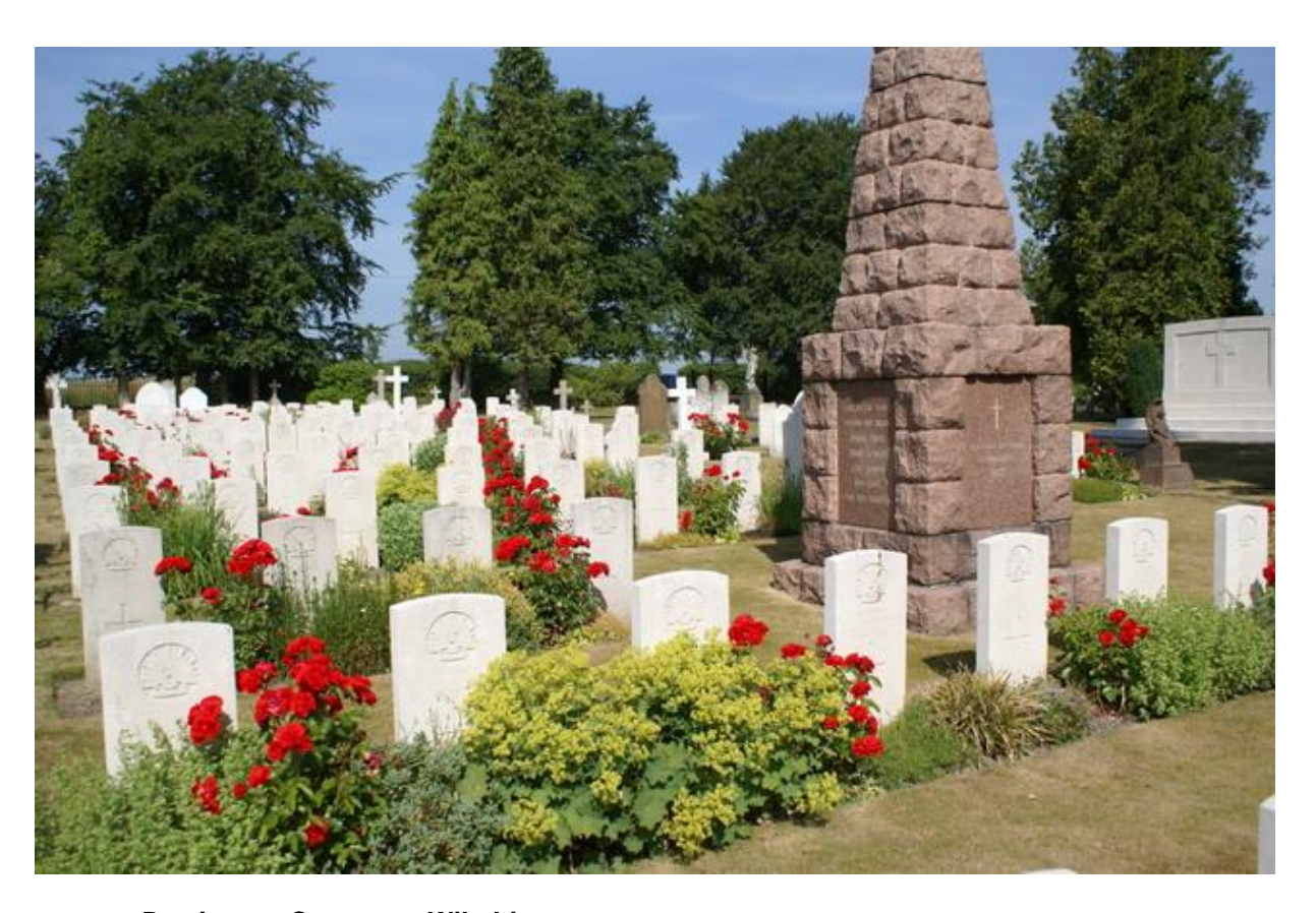
Durrington Cemetery, Wiltshire