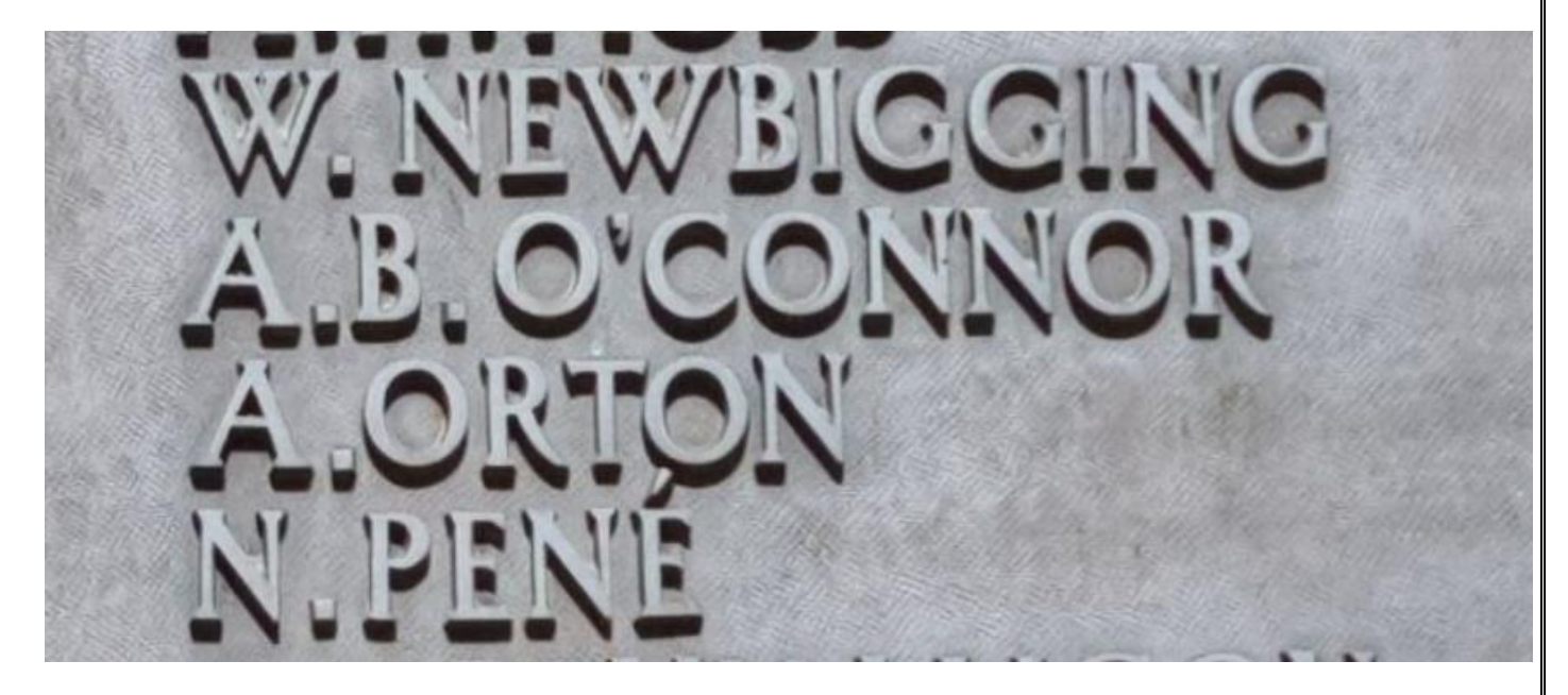
Postmaster-General's Department Roll of Honour