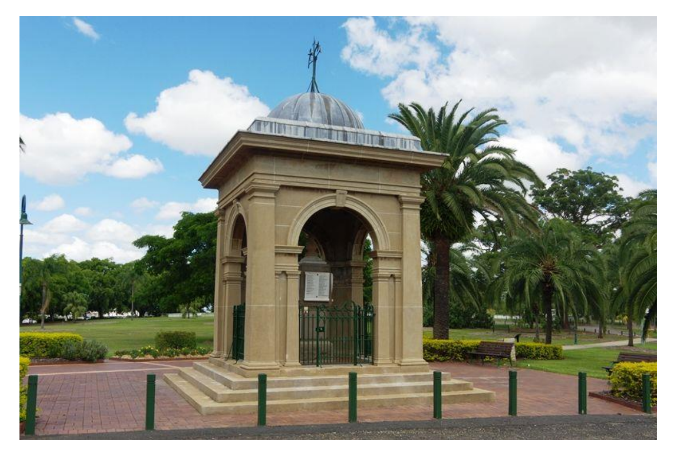
Yeronga Cenotaph / War Memorial