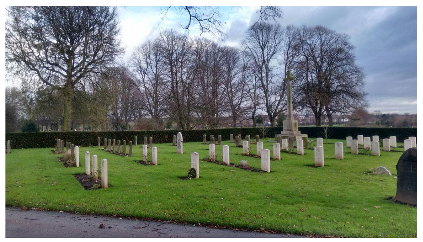
Nottingham Road Cemetery, Derby