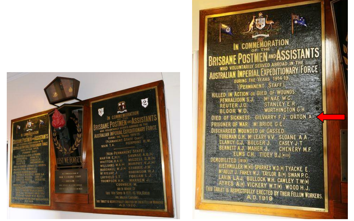
Brisbane Postmen & Assistants Honour Roll