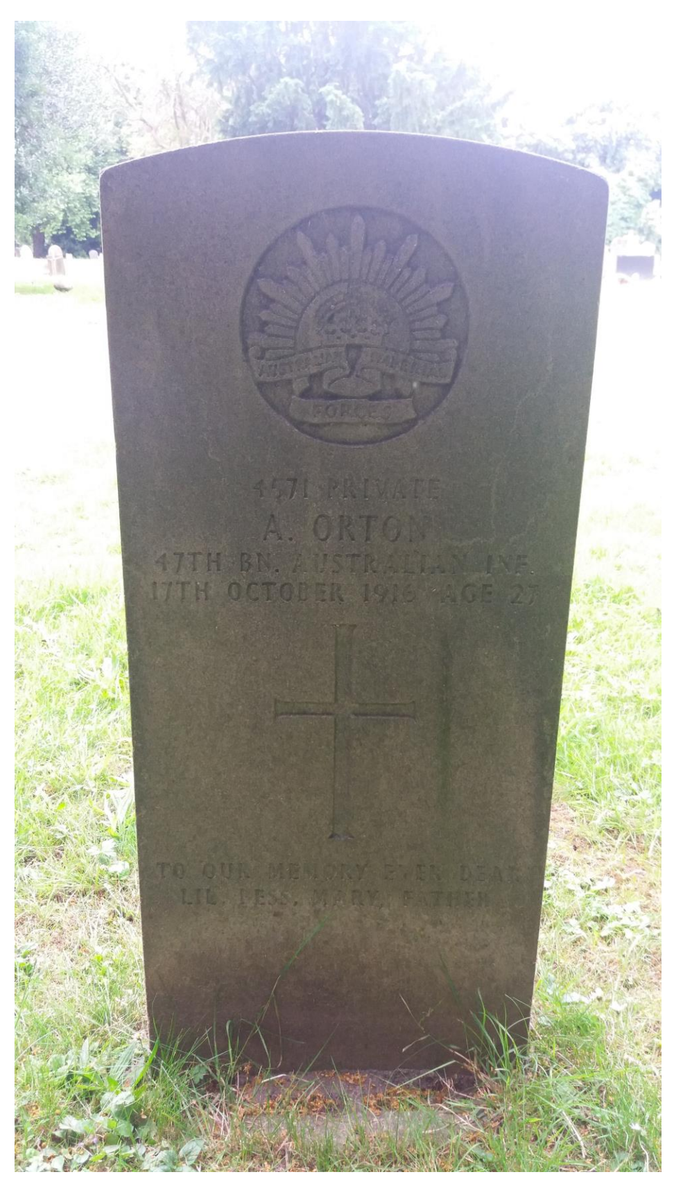
Photo of Private A. Orton's Commonwealth War Graves Commission Headstone in Nottingham Road Cemetery, Derby, Derbyshire, England.