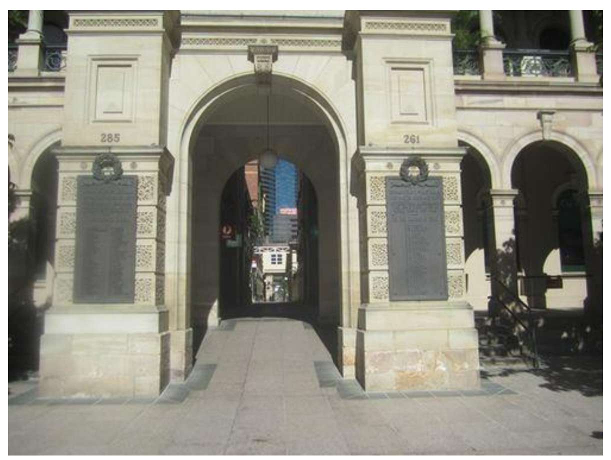
Postmaster-General's Department Roll of Honour