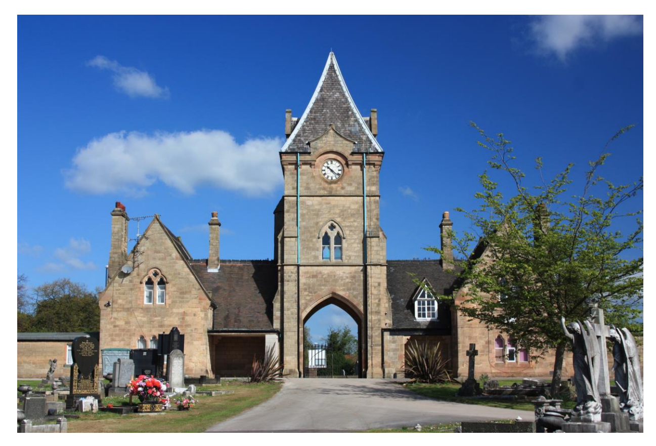
Nottingham Road Cemetery, Derby

Nottingham Road Cemetery, Derby contains 193 First World War burials and 134 from the Second World War. There is a small war graves plot of about 40 burials from both wars, the rest of the graves are scattered throughout the cemetery. ( Information from CWGC )