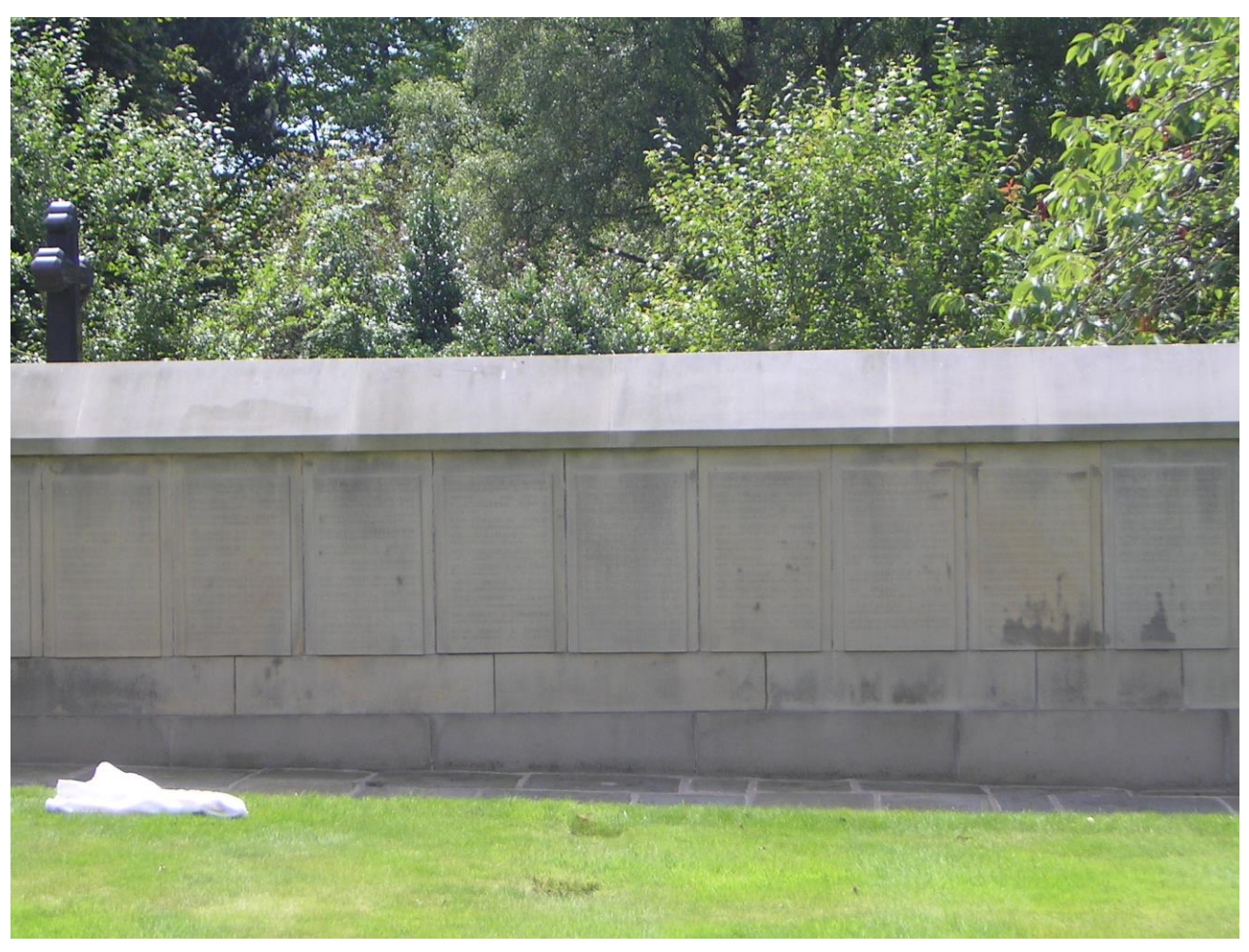
WW1 Screen Wall in Garden of Remembrance