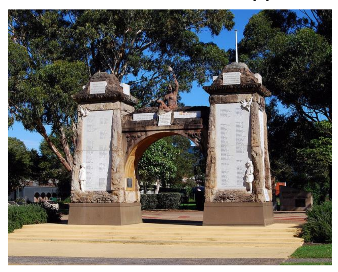
War Memorial Arch at MacCabe Park, Wollongong