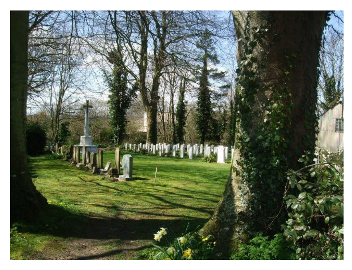
St. Mary's New Churchyard, Codford