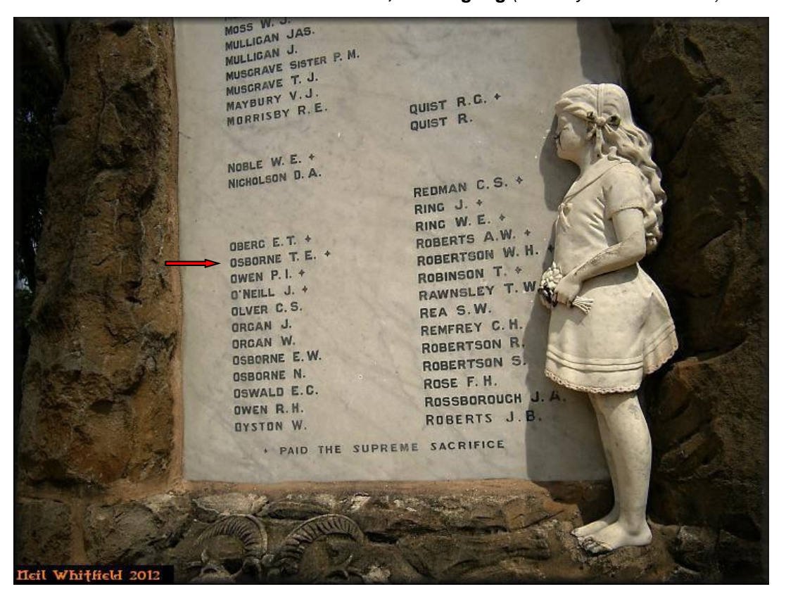
War Memorial Arch at MacCabe Park, Wollongong