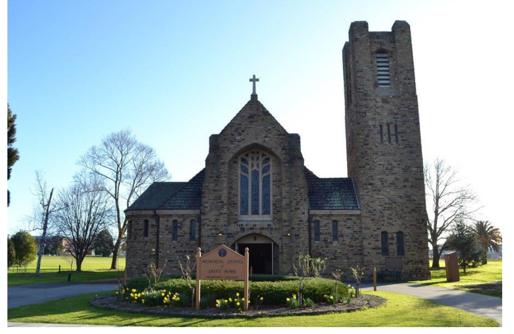
HMAS Cerberus Protestant Chapel of St Mark, Crib Point, Victoria