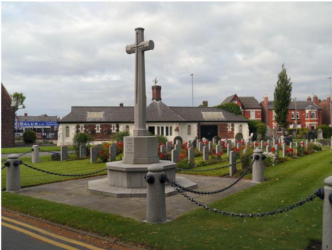
Cross of Sacrifice & War Graves in Warrington Cemetery