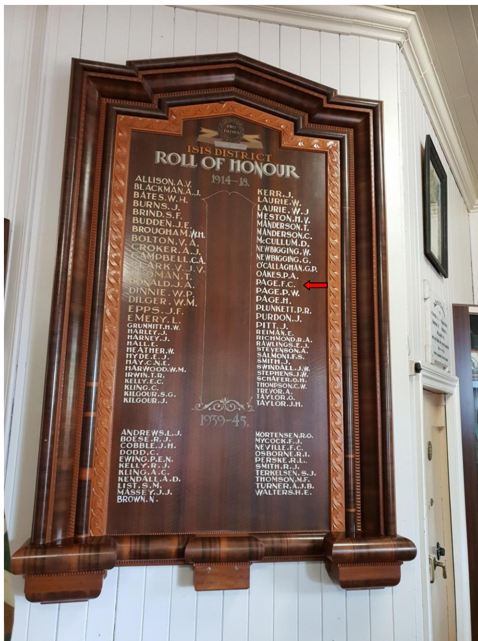
Isis District Roll of Honour

F. C. Page is remembered on the Isis District Roll of Honour, located at Isis sub-branch RSL, 55 Churchill Road, Childers, Queensland.