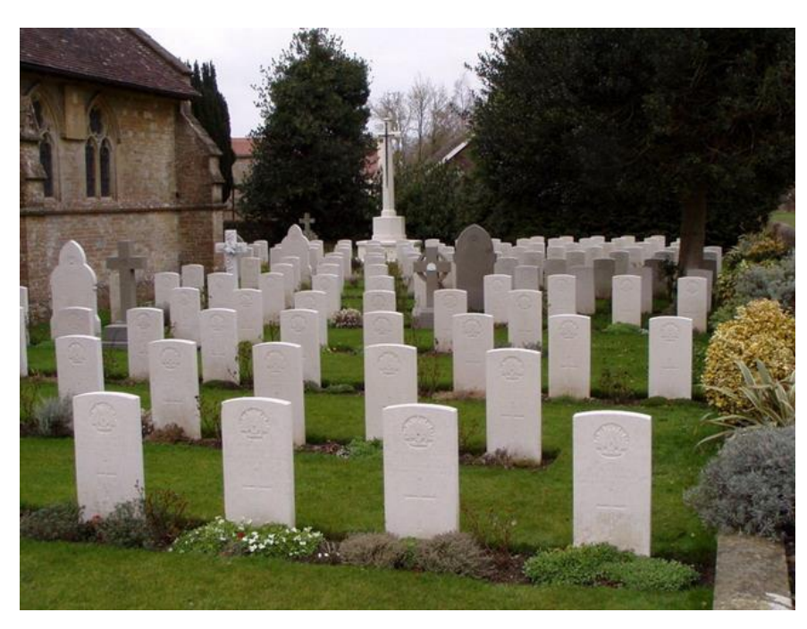
War Graves at Sutton Veny