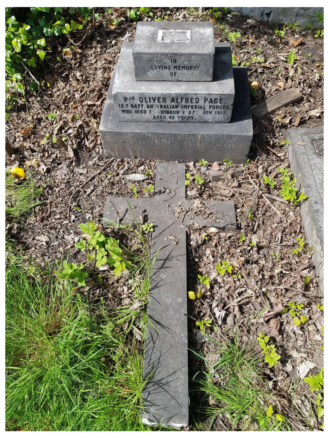
Photo of Private Oliver Alfred Page's Private Headstone in Warriston Cemetery, Edinburgh, Scotland.