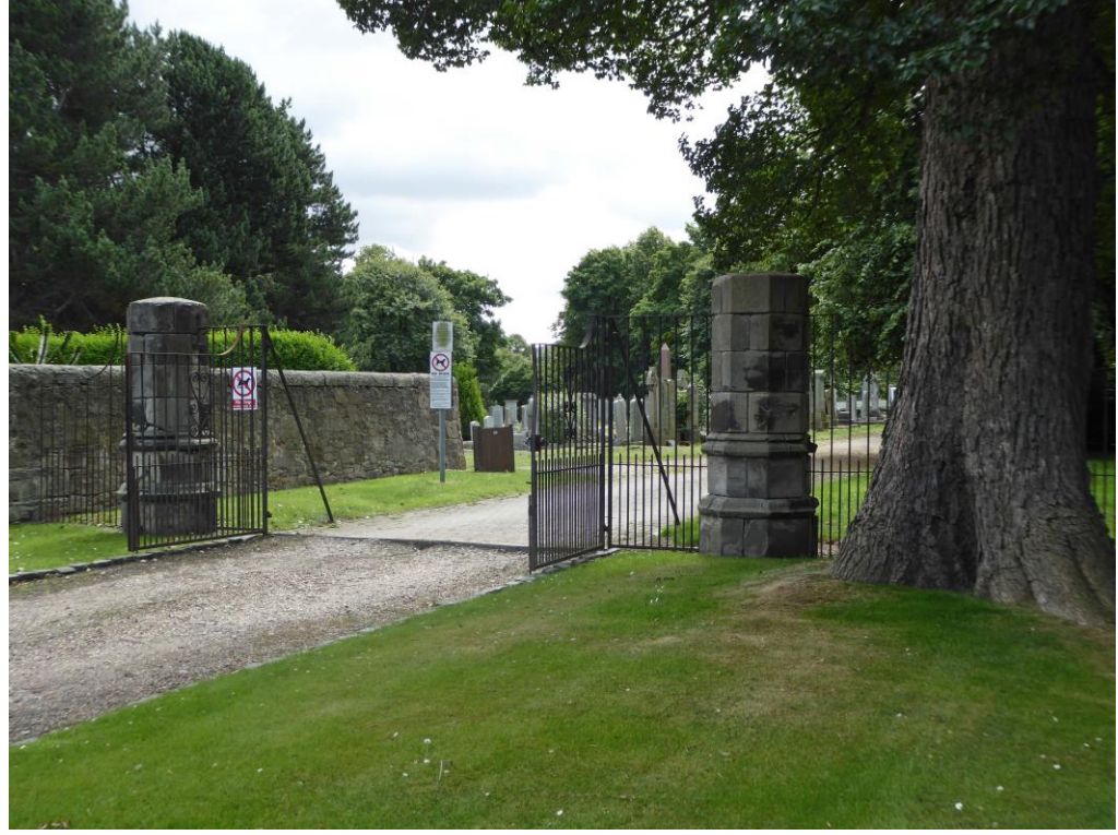
Warriston Cemetery, Edinburgh

Warriston Cemetery, Edinburgh, Scotland contains 72 scattered burials of the First World War; a screen wall commemorates those whose graves are not individually marked by headstones. Second World War burials number 27, and there is also one Belgian war grave and one non-war service burial within the cemetery. The cemetery is maintained by the City of Edinburgh Council. A number of grave stones are lying flat for safety reasons. (Information from CWGC)