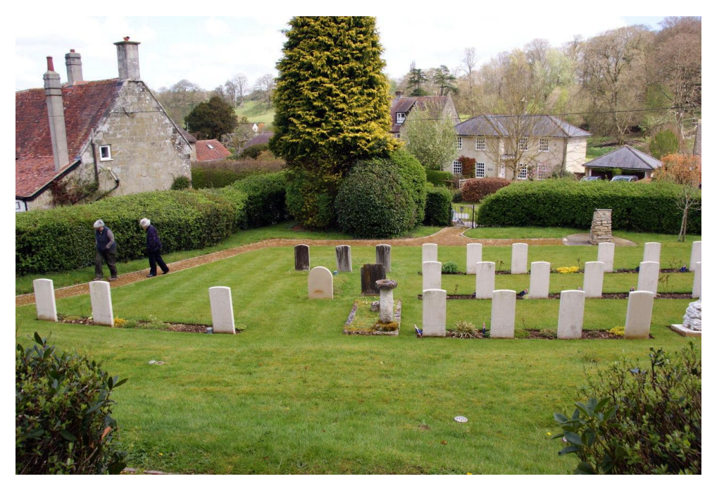
Photo taken from back of Cemetery looking towards the Entrance