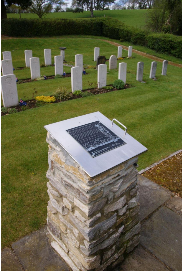
Left & right of Cemetery with central Plinth