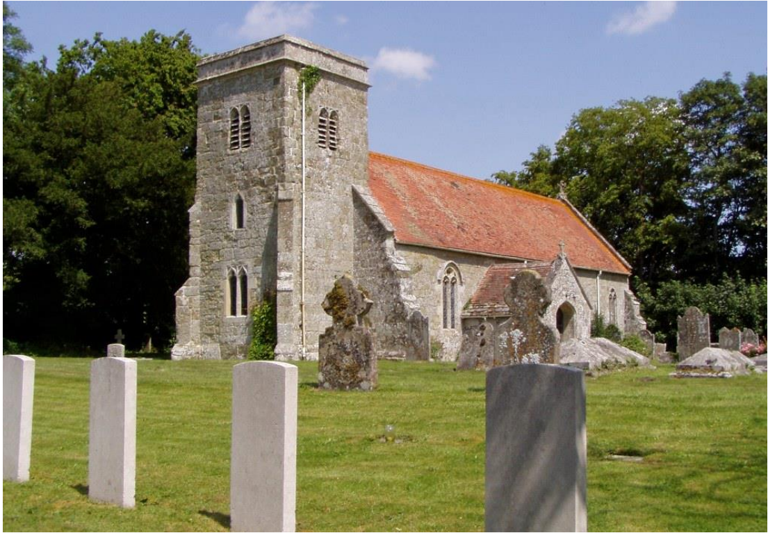
St. Edith's Churchyard, Baverstock, Wiltshire.