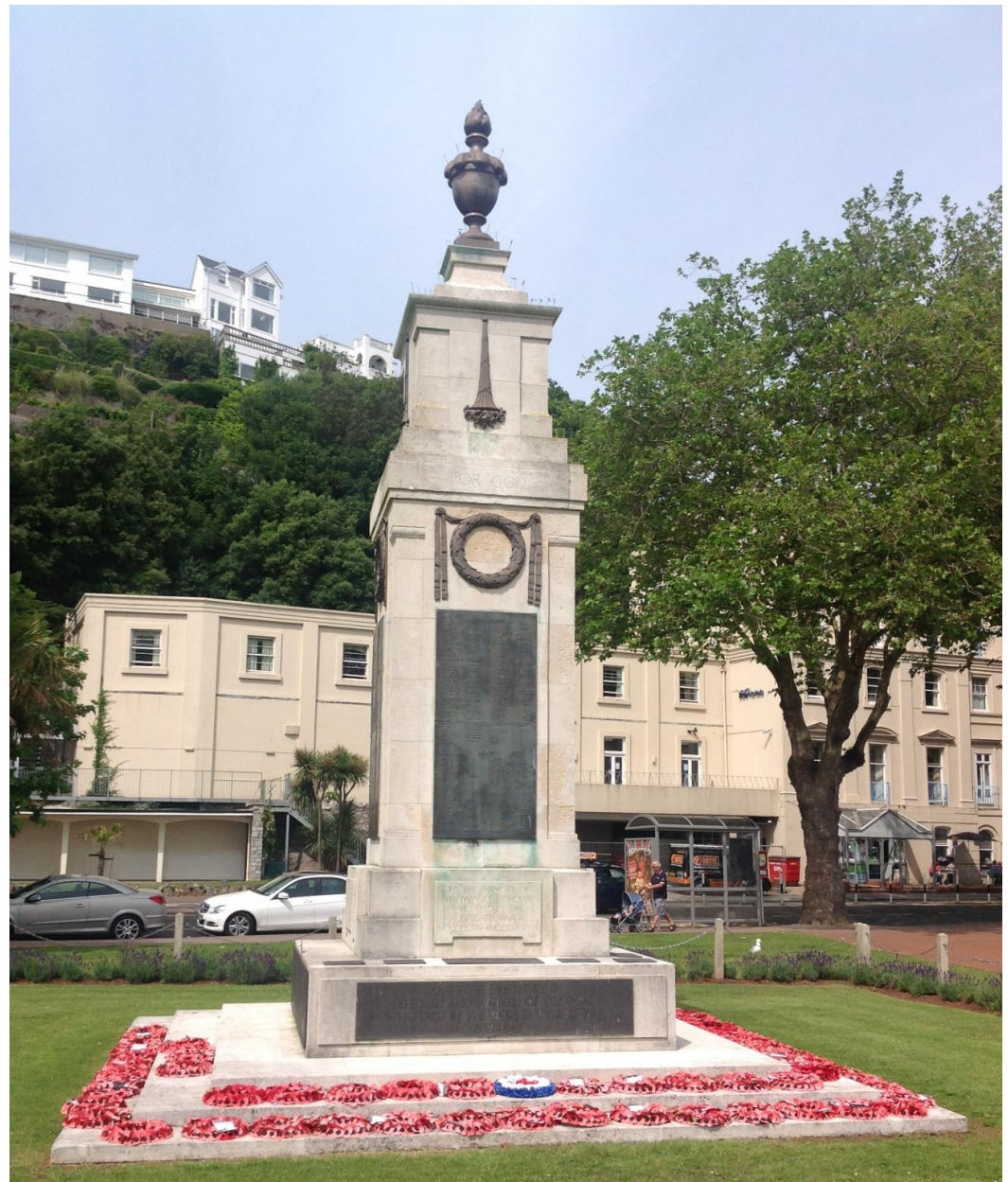
Torquay War Memorial