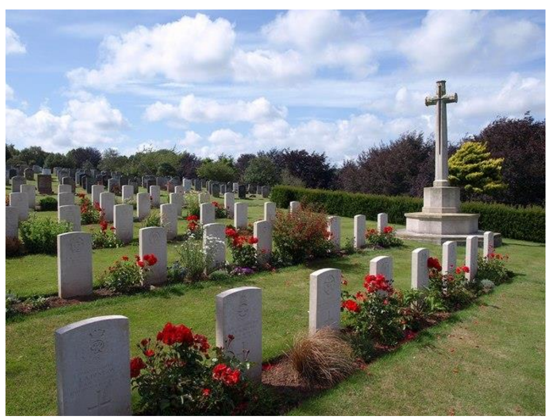
War Graves in Torquay Cemetery