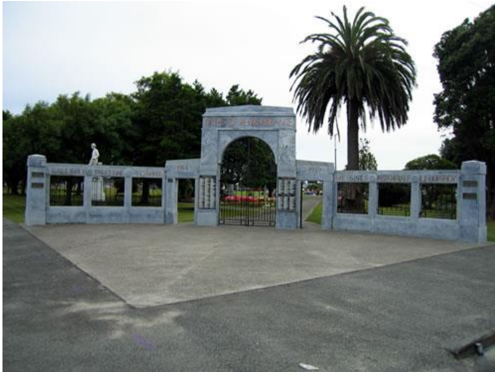
Westport War Memorial, New Zealand