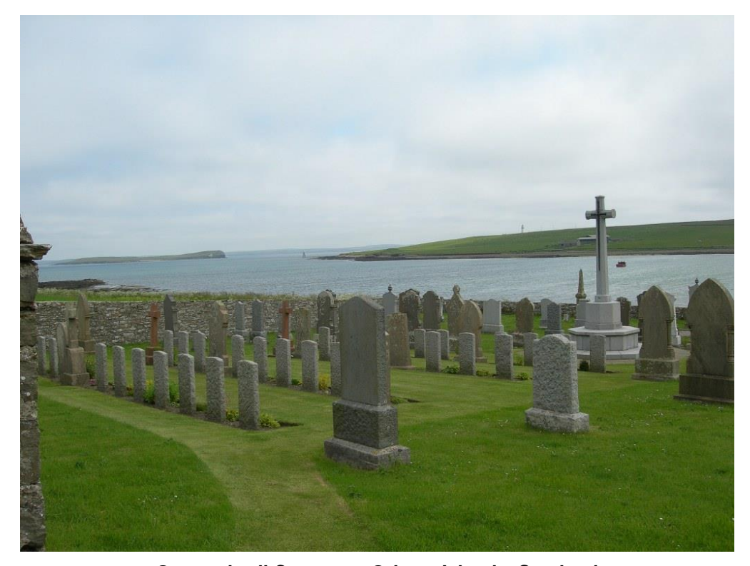
Osmondwall Cemetery, Orkney Islands, Scotland