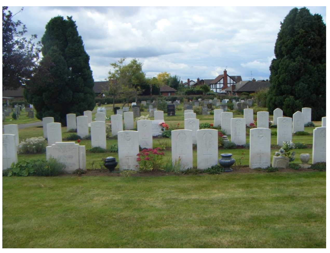
War Graves in Cheltenham Cemetery, Gloucestershire