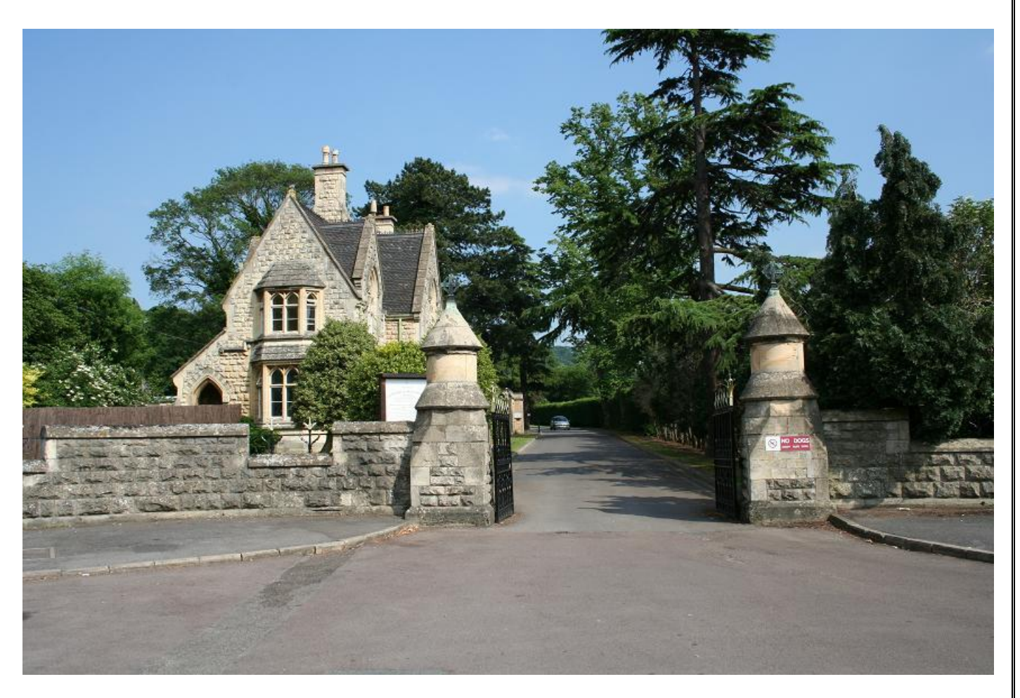
Entrance to Cheltenham Cemetery, Gloucestershire