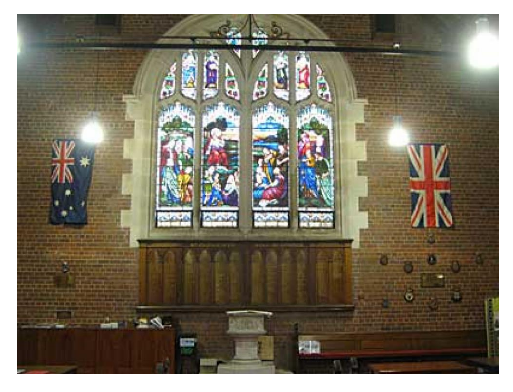
St. Clement's World War 1 Roll of Honour