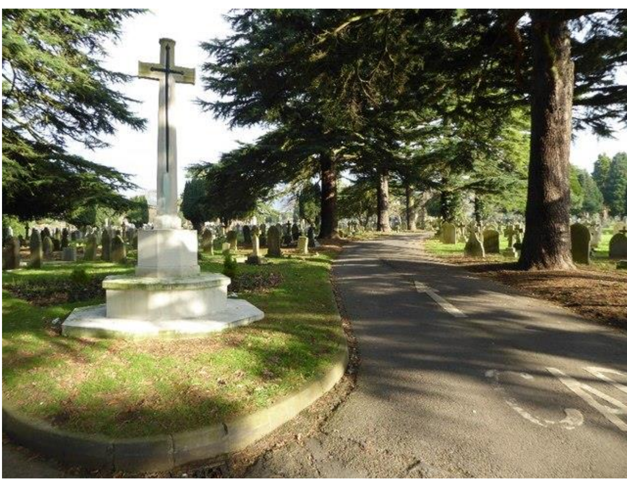
Cross of Sacrifice in Cheltenham Cemetery, Gloucestershire