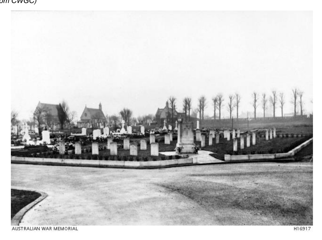
A group of Soldiers' graves in the Australian Section of Wandsworth Cemetery, London (taken 15 April, 1931)

There are 34 Australian World War 1 Soldiers buried here & 1 Australian Soldier from 1925. (Information from CWGC)