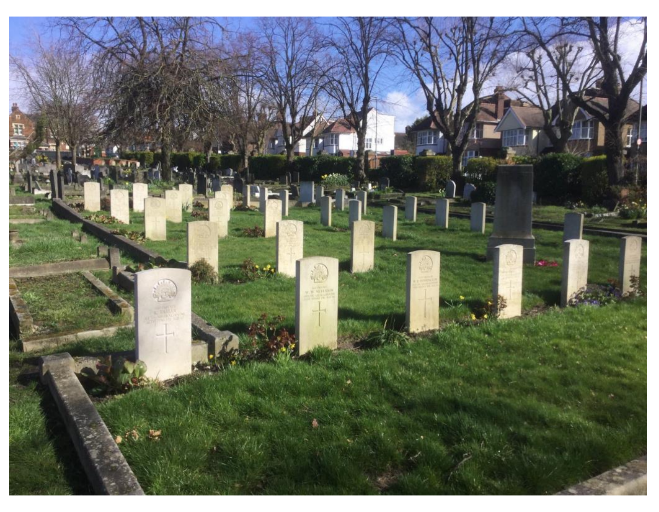
The Australian Plot in Wandsworth Cemetery, London