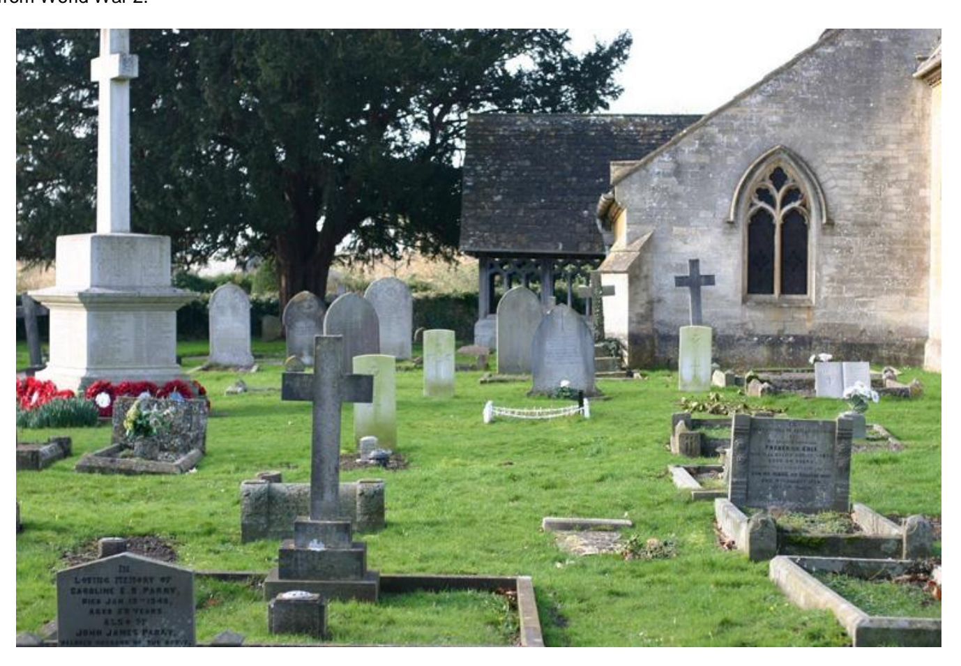
St. Saviour's Churchyard, Tetbury

St. Saviour's Church Cemetery, Tetbury contains 16 Commonwealth War Graves – 6 are from World War 1 & 10 are from World War 2.