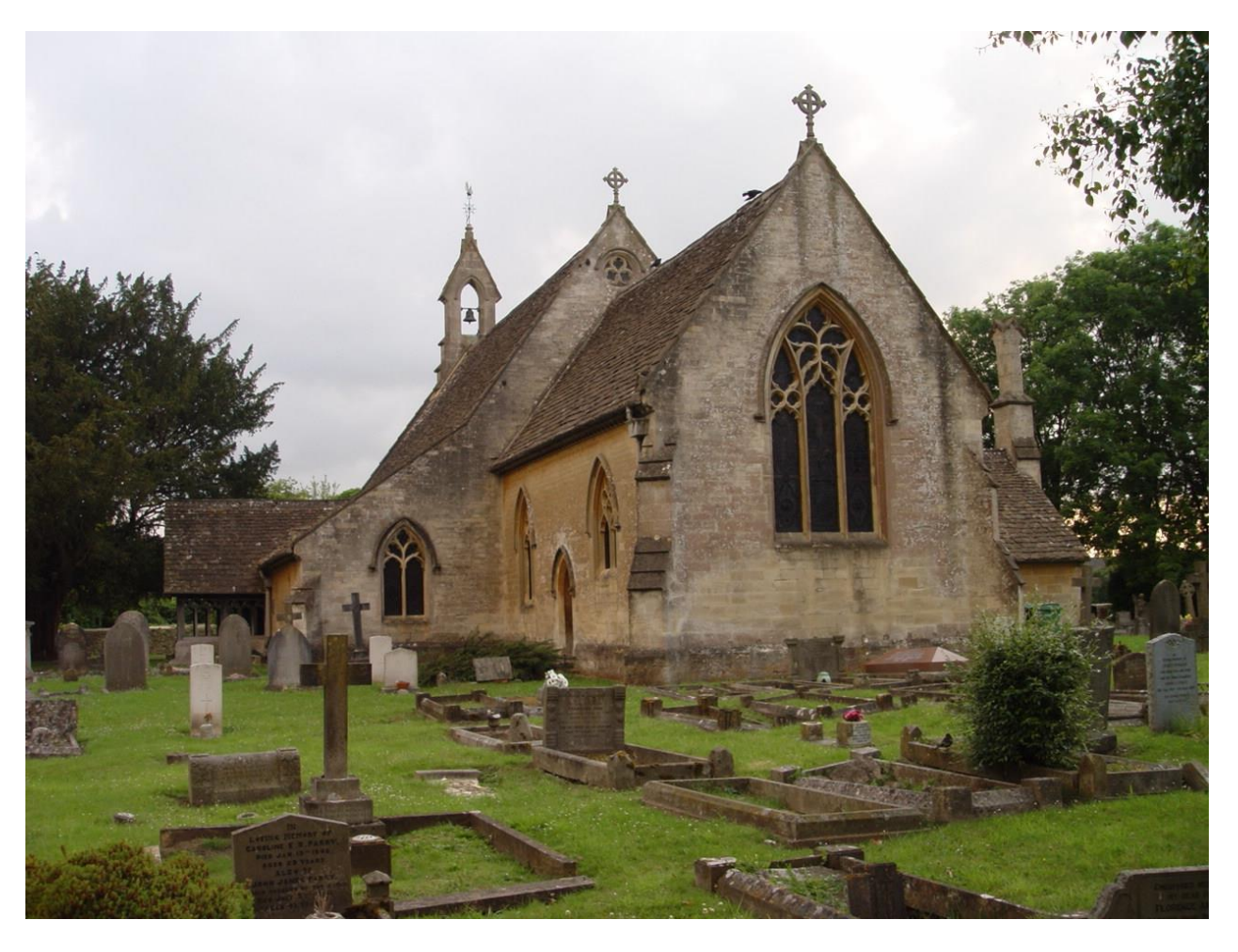
St. Saviour's Church, Tetbury