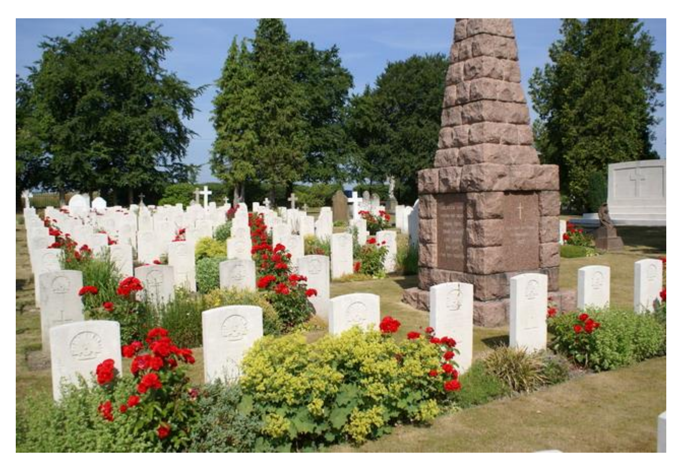
Durrington Cemetery, Wiltshire