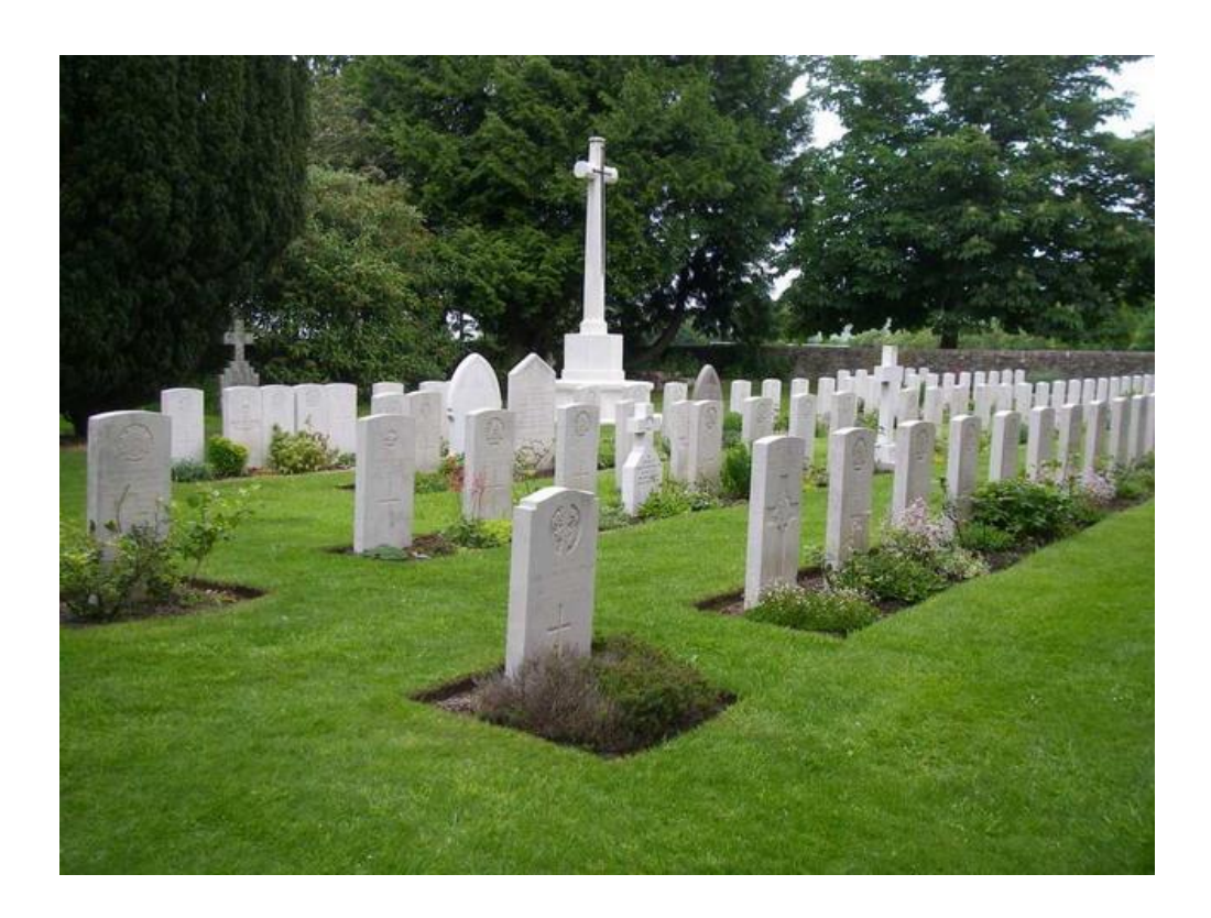
War Graves at Sutton Veny