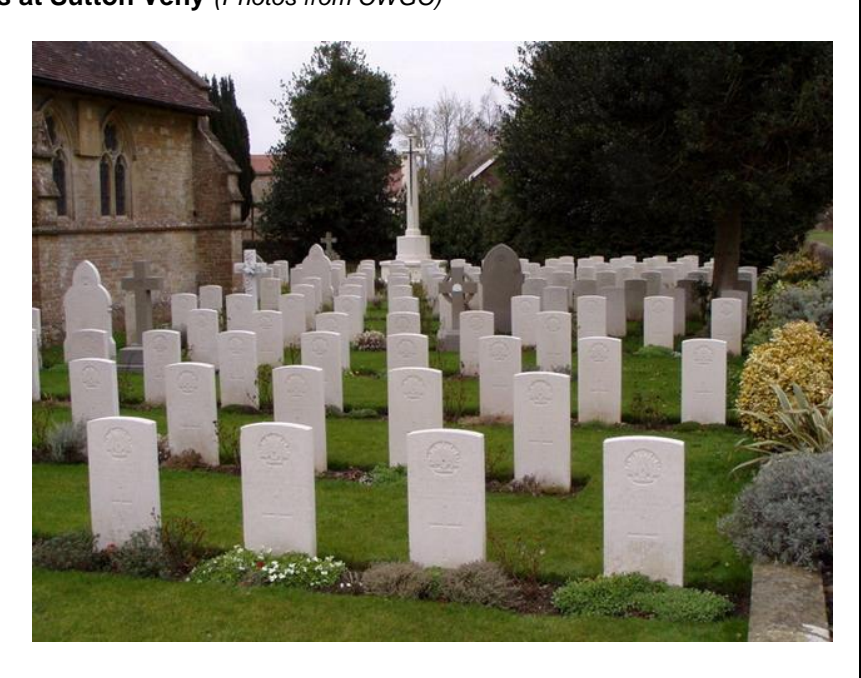
War Graves at Sutton Veny