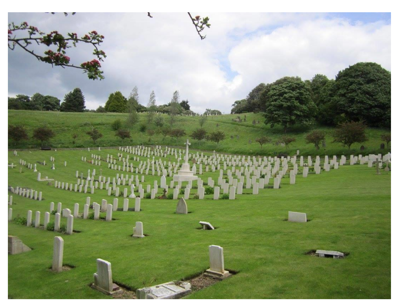
Shorncliffe Military Cemetery, Folkestone