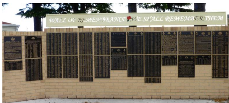
Wall of Remembrance, St. Helens, Tasmania

"What these men did nothing can alter now. The good and the bad, the greatness and the smallness of their story will stand. Whatever of glory it contains nothing now can lessen. It rises, as it will always rise, above the mists of ages, a monument to great hearted men; and for their nation, a possession forever. "