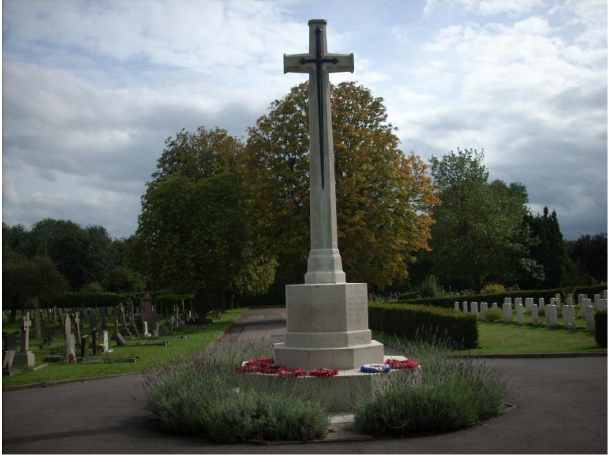
Cross of Sacrifice