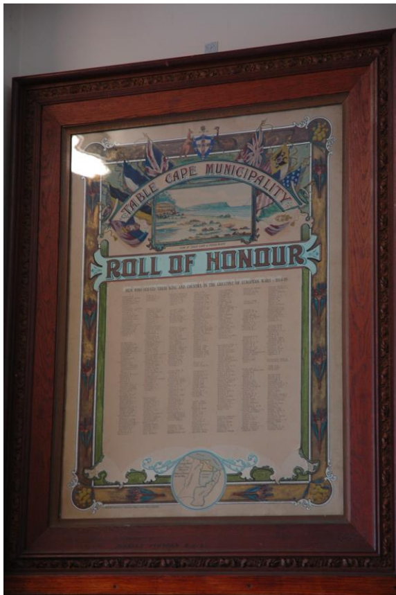
Table Cape Municipality Roll of Honour

A. H. Poole is remembered on the Table Cape Municipality Roll of Honour, located in Wynyard RSL Club, 9 Goldie Street, Wynyard, Tasmania.