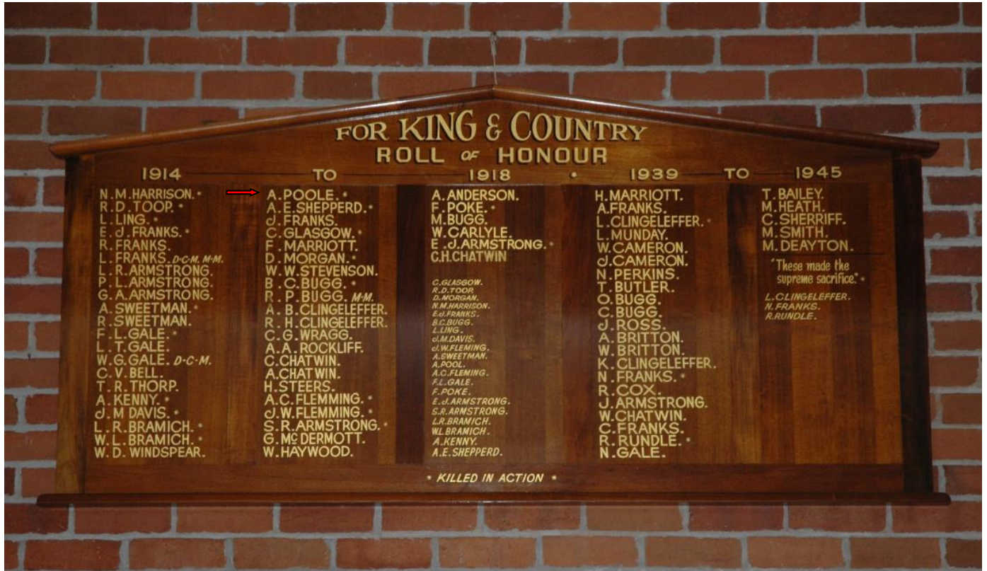
Elliott Roll of Honour