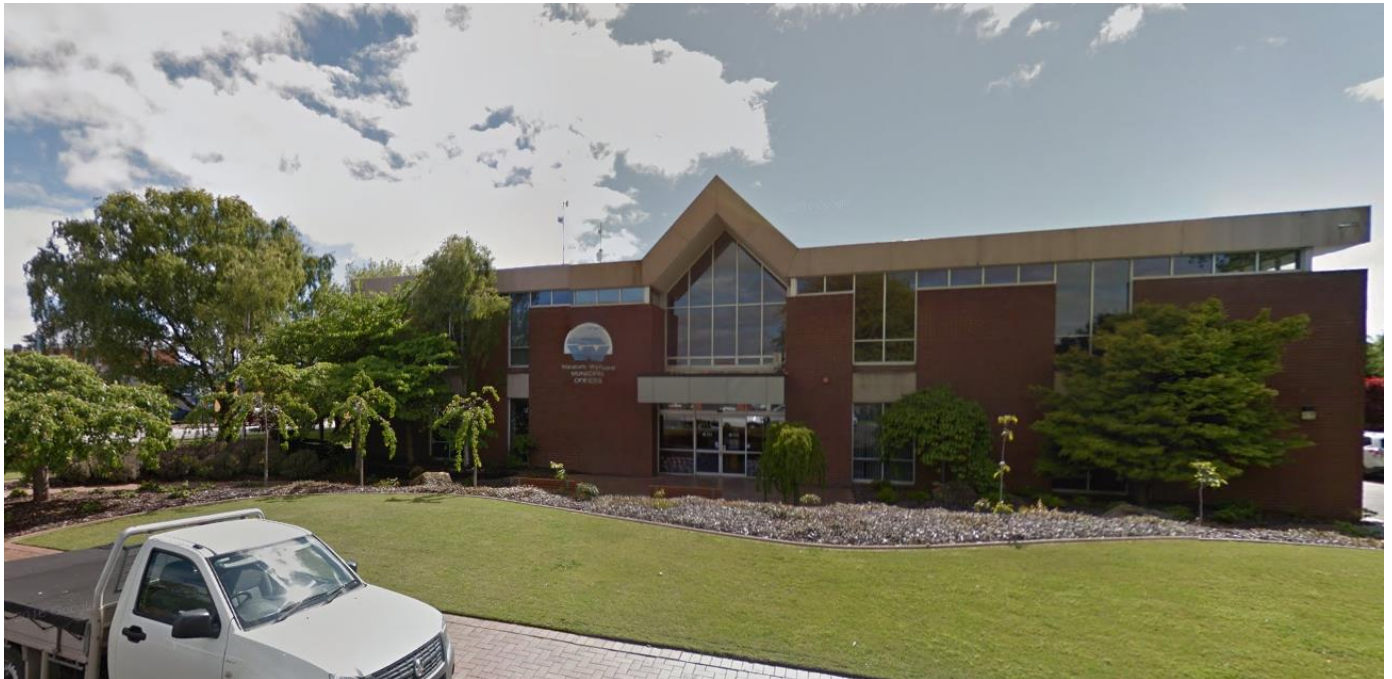
Wynyard - Waratah Council Chambers