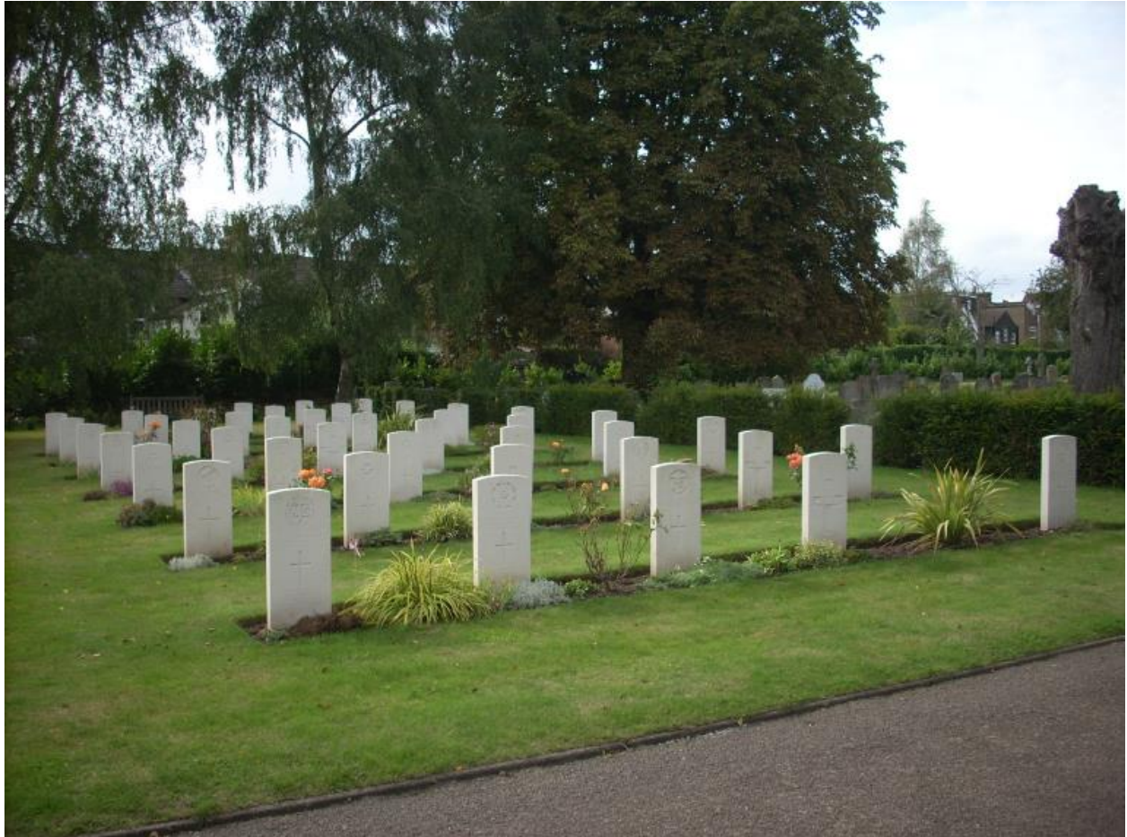
War Graves in Hatfield Road Cemetery, St. Albans