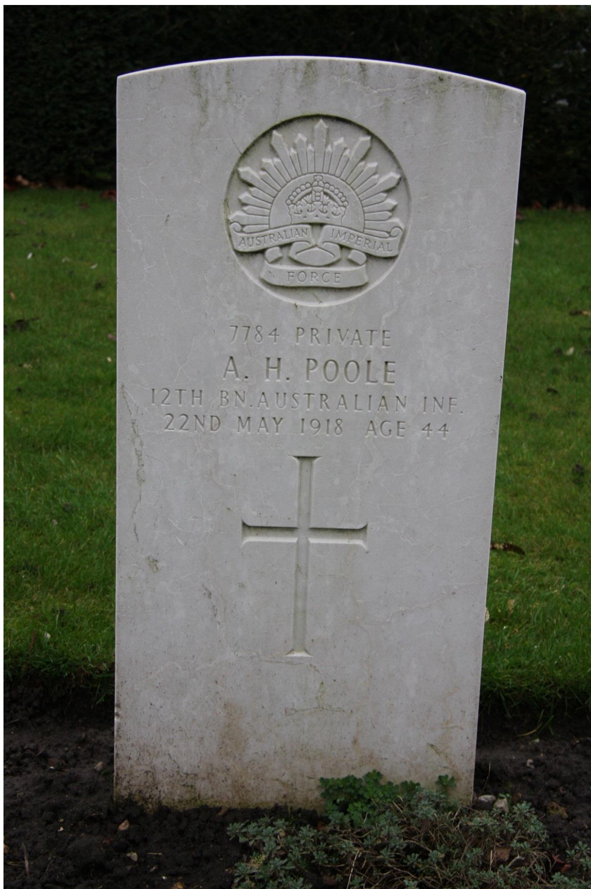
Photo of Private A. H. Poole's Commonwealth War Graves Commission Headstone in Hatfield Road Cemetery, St. Albans, Hertfordshire, England.