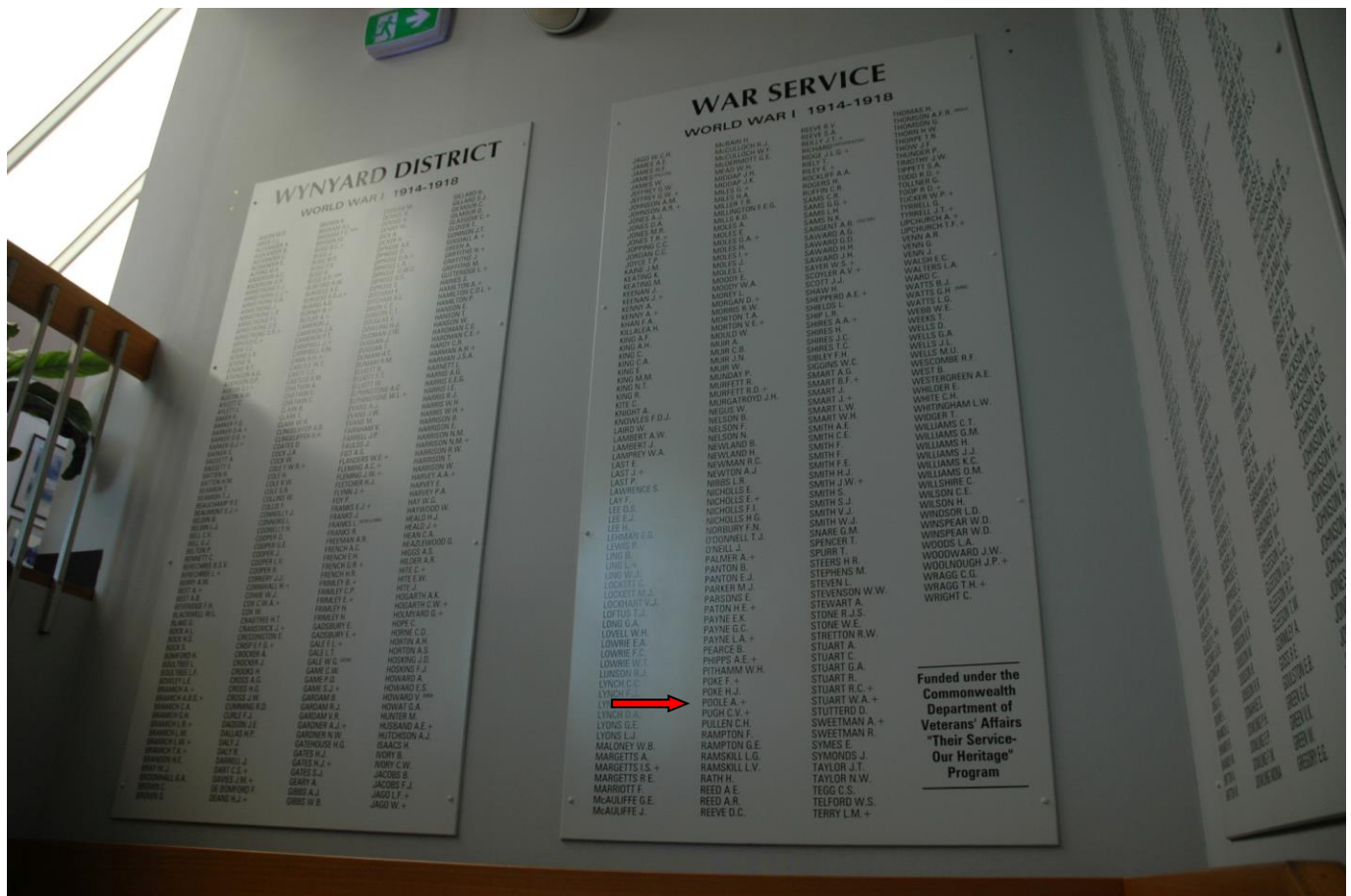
Wynyard District Honour Roll