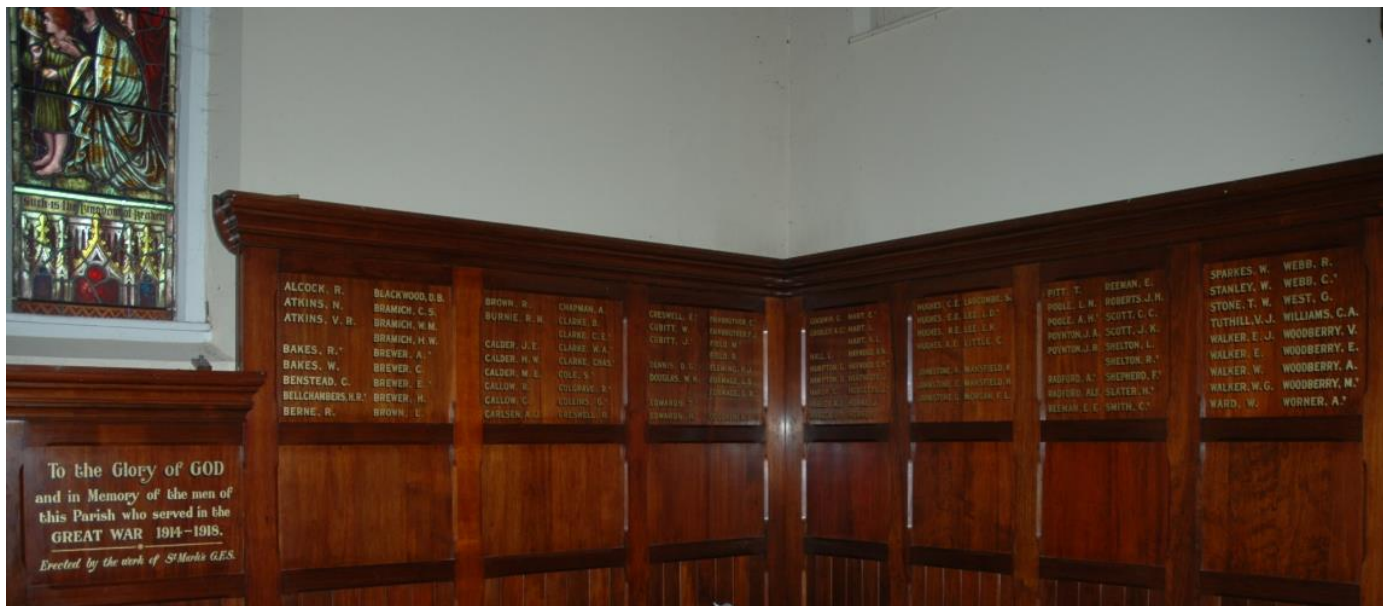
St. Mark's Anglican Church Honour Board