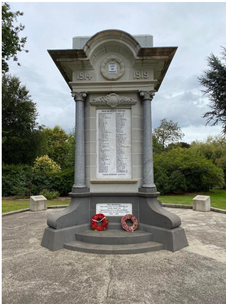
Deloraine War Memorial