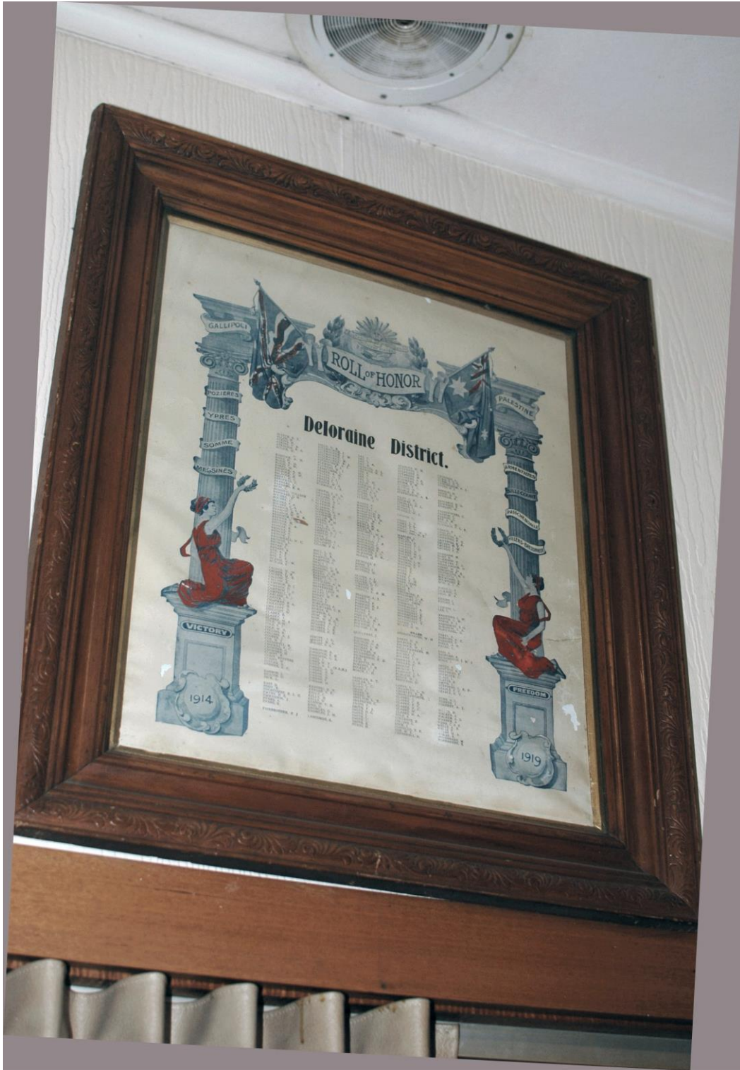
Deloraine District Honour Roll