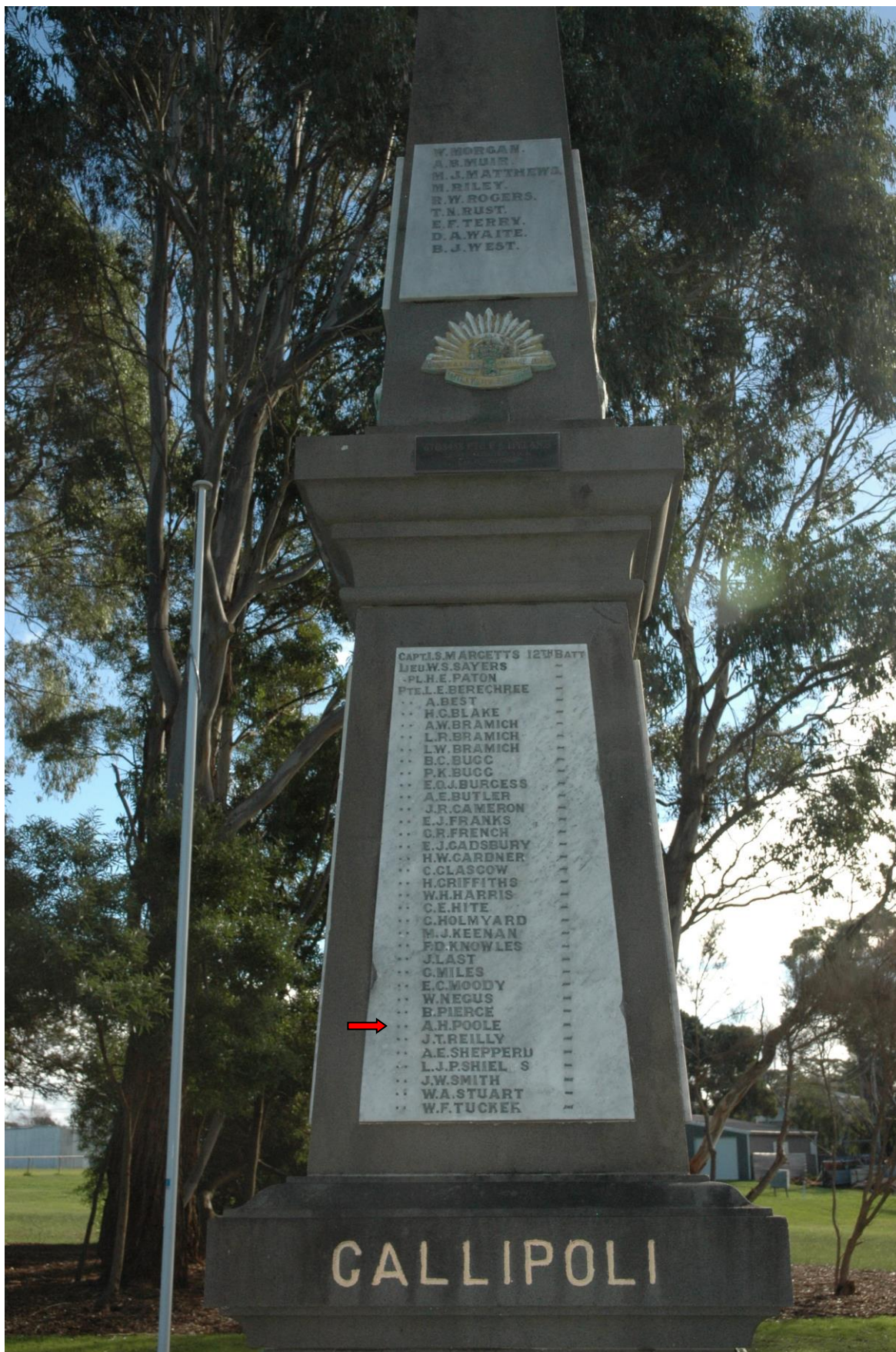
Wynyard Cenotaph/War Memorial