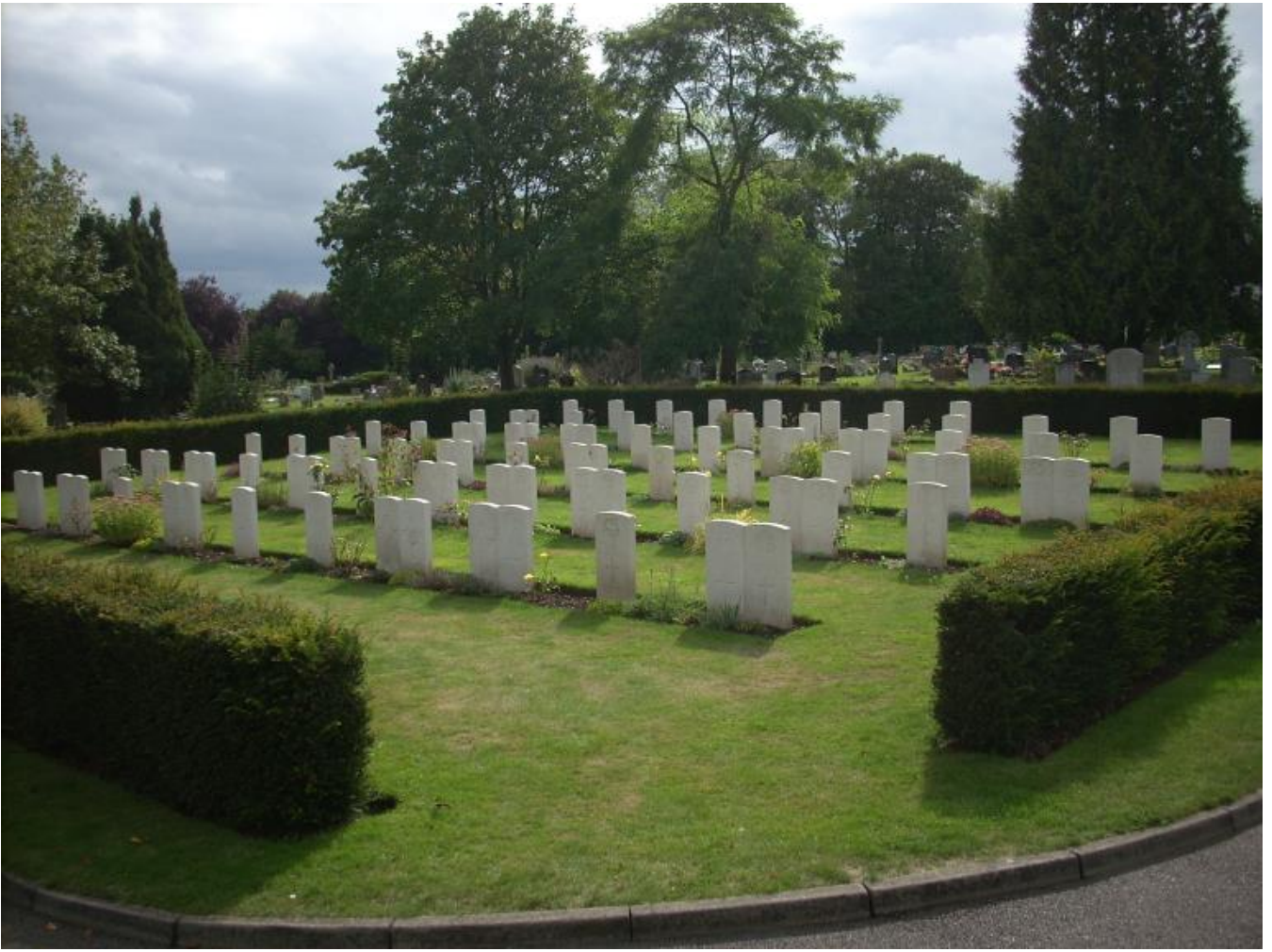
War Graves in Hatfield Road Cemetery, St. Albans