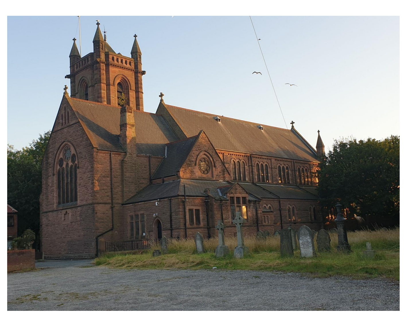
View of Churchyard at back of Church