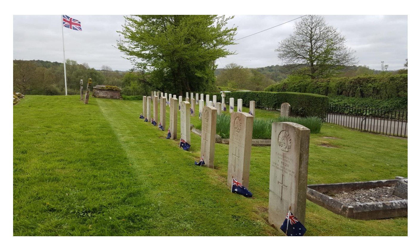
St. Edith's Churchyard, Baverstock