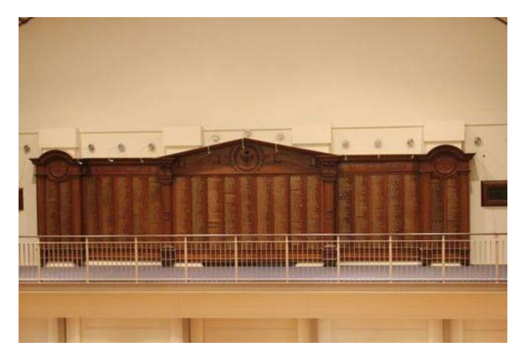
Unley City Honour Roll

J. Radoslovich is remembered on the Unley City Honour Roll, located Town Hall, Unley Road, & Oxford Terrace, Unley, South Australia.