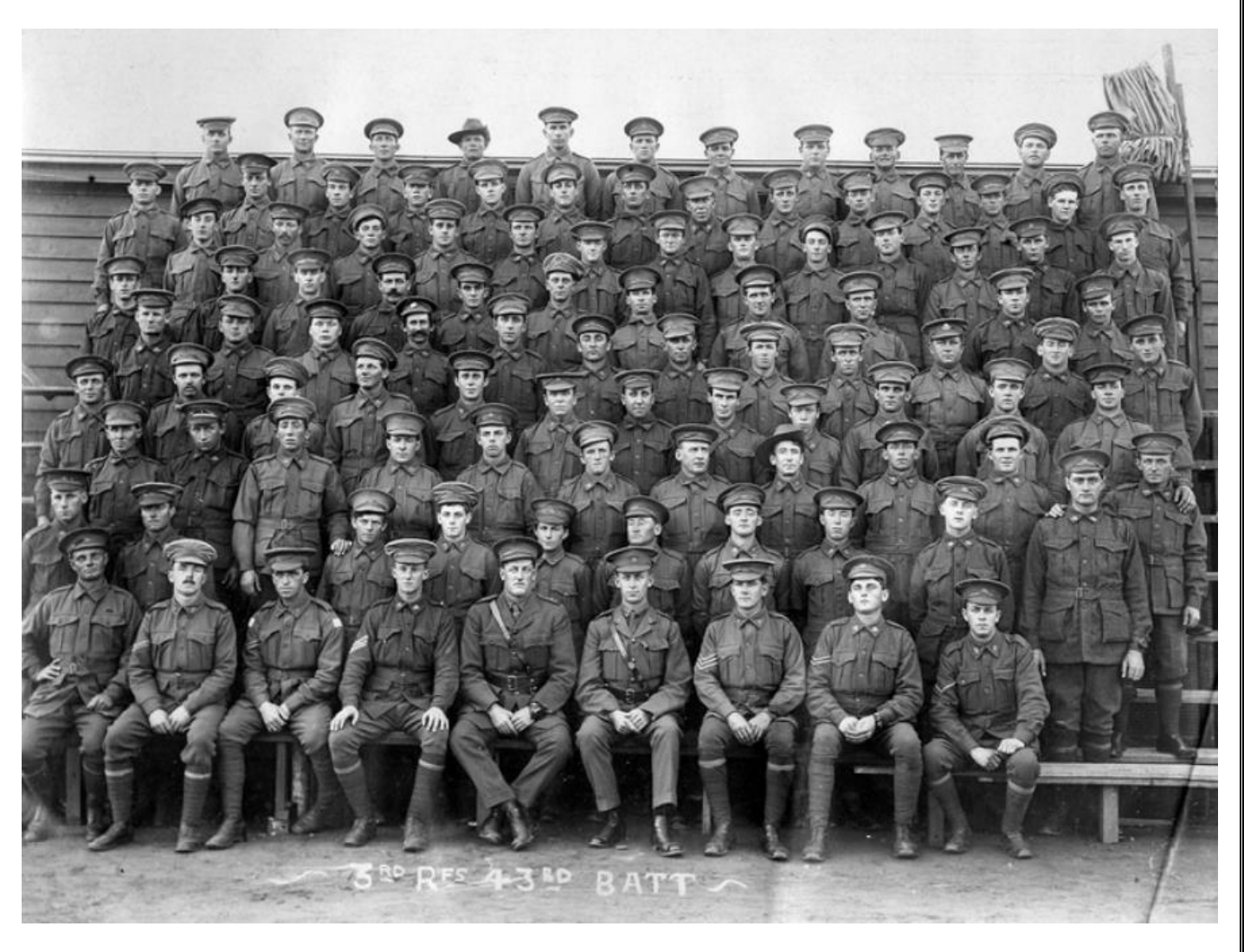
Men of 3rd Reinforcements, 43rd Battalion