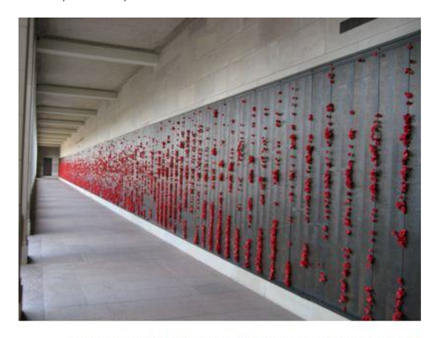
Roll Of Honour WW1 Australian War Memorial Canberra, Australia

Private A. E. Randell is commemorated on the Roll of Honour, located in the Hall of Memory Commemorative Area at the Australian War Memorial, Canberra, Australia on Panel 144.