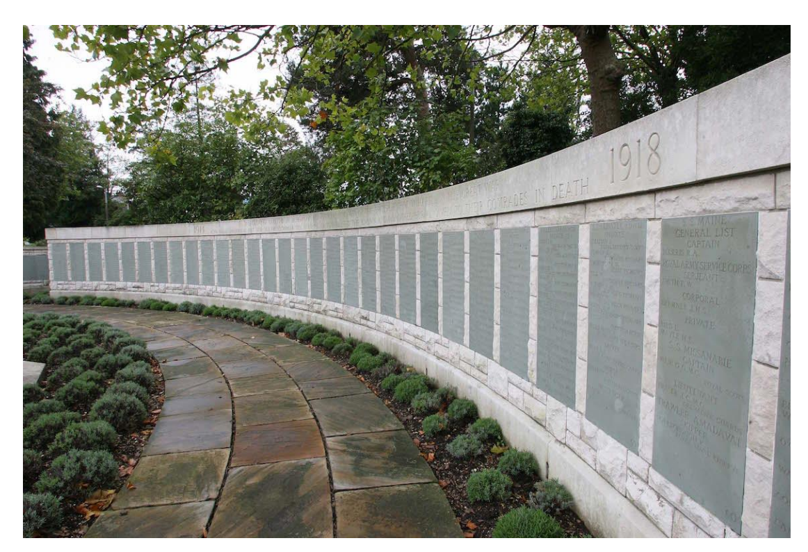
Name Panels behind Cross of Sacrifice