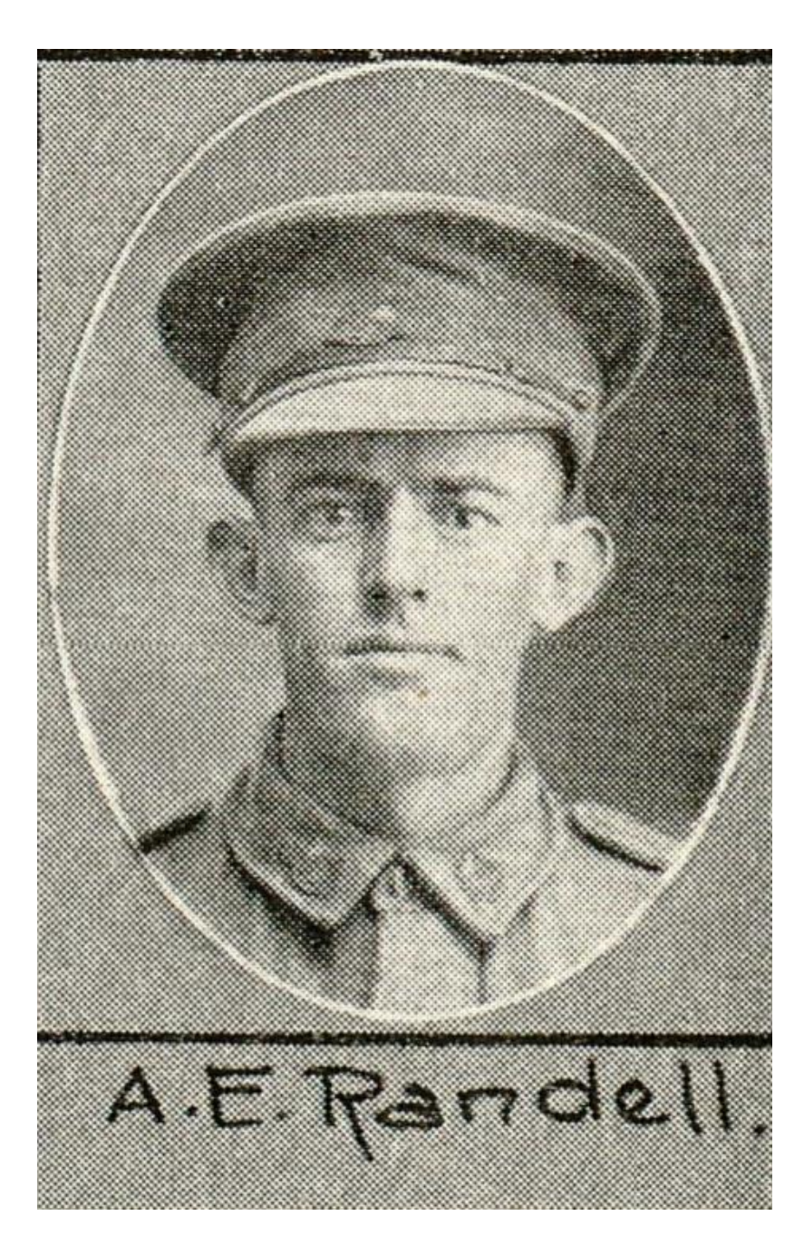
(The Queenslander Pictorial - 7 October, 1916)

Information obtained from the CWGC, Australian War Memorial (Roll of Honour, First World War Embarkation Roll, Red Cross Wounded & Missing) & National Archives