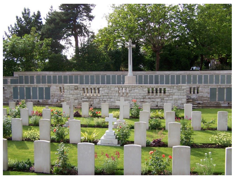
CWGC Graves in Hollybrook Cemetery with Cross of Sacrifice & Hollybrook Memorial