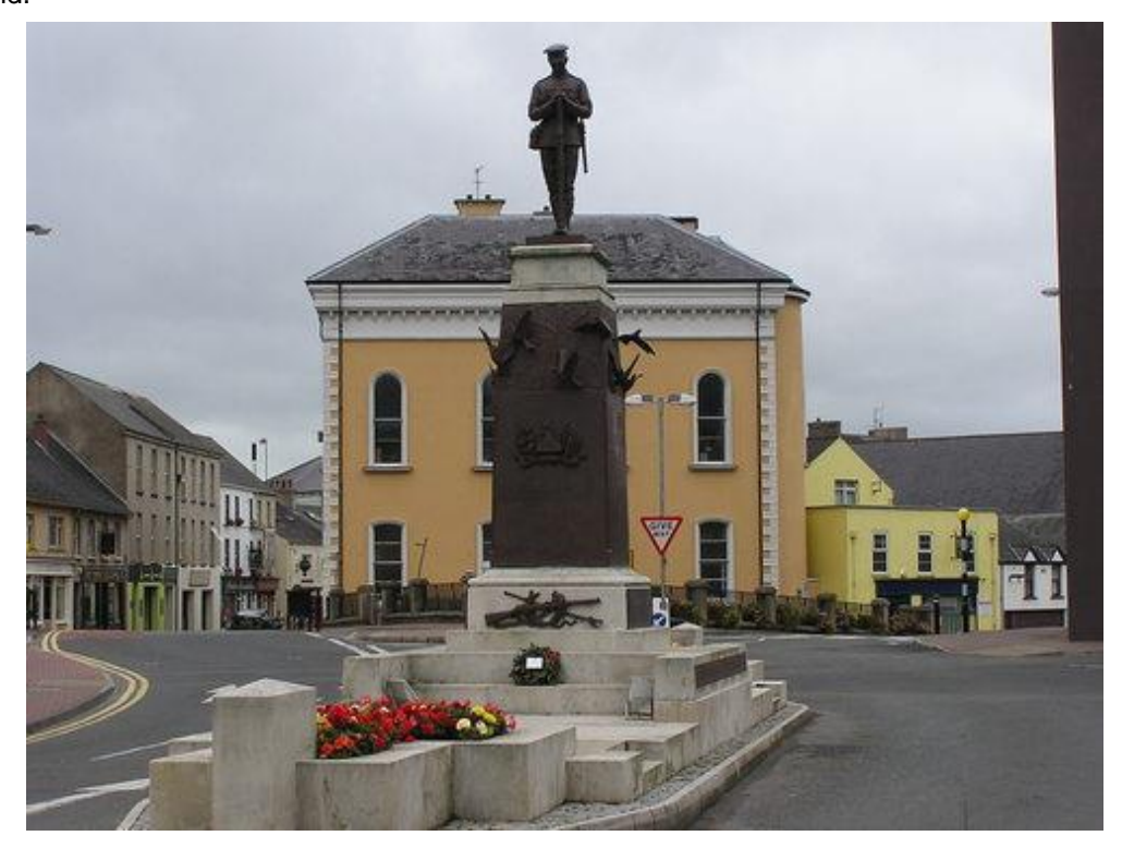
Enniskillen War Memorial