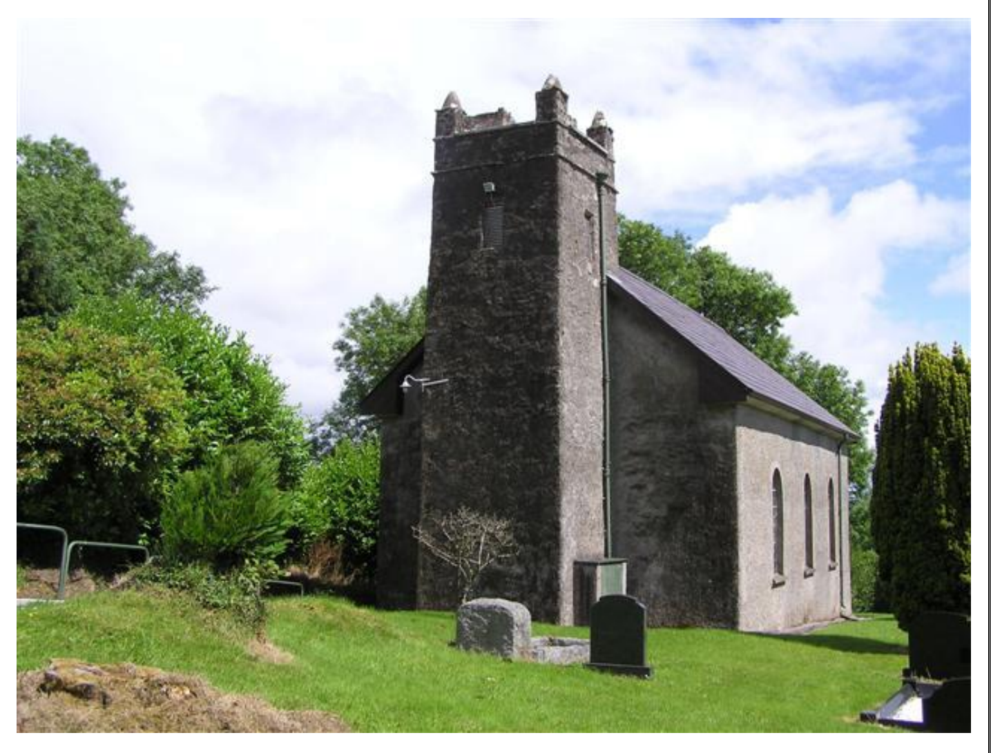
Church of Ireland, Boho

The Church of Ireland Churchyard, Boho contains just one Commonwealth War Grave.