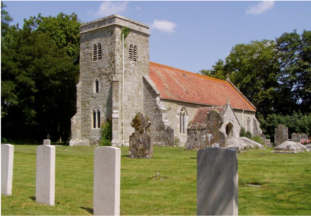
St. Edith's Churchyard, Baverstock, Wiltshire.