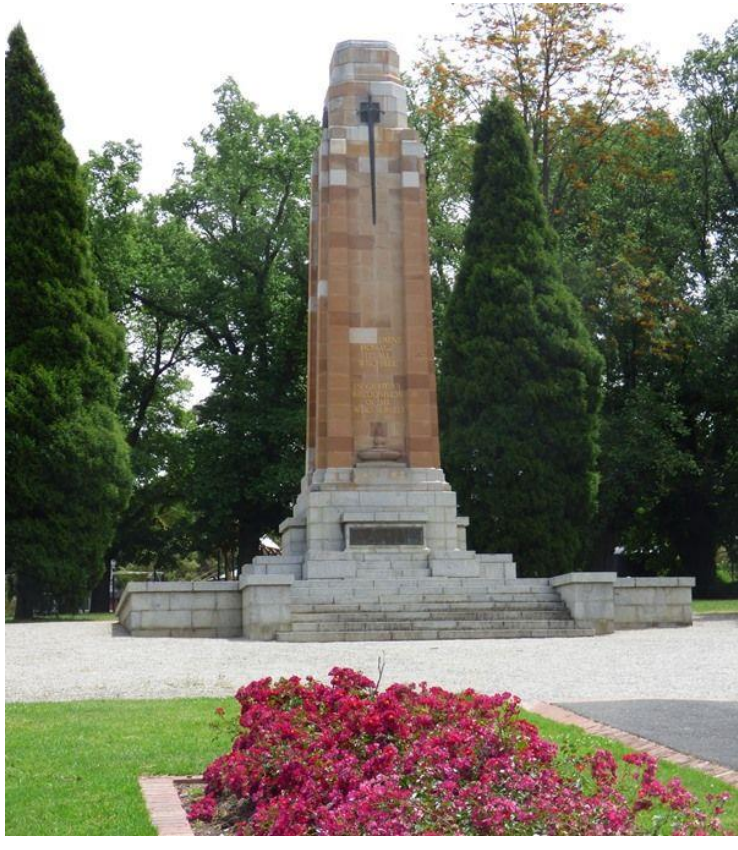
Hawthorn Cenotaph

The Hawthorn Cenotaph, located in St. James Park, Burwood Road, Hawthorn Victoria does not list individual names.