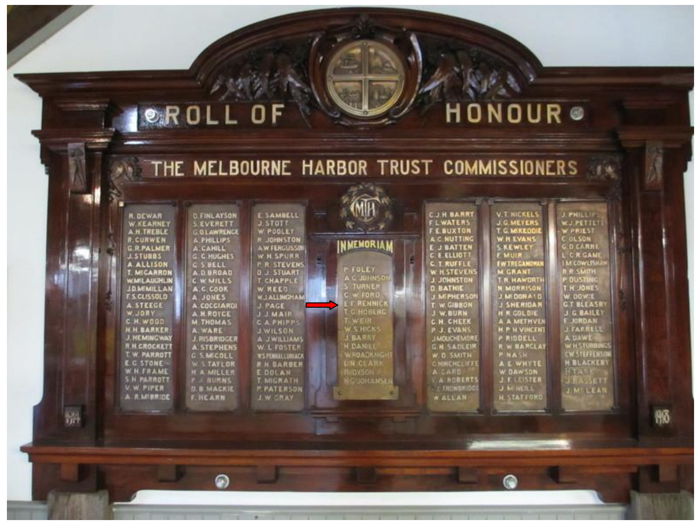
Melbourne Harbour Trust Honour Roll

E. F. Rennick is remembered on the Melbourne Harbour Trust Honour Roll, located at 2A Clarendon Street, Southbank, Melbourne, Victoria.