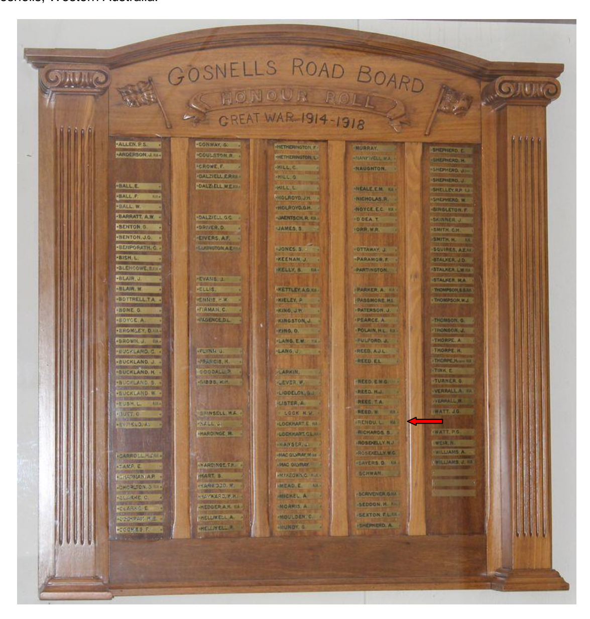
Gosnells Road Board Honour Roll

L. Renou is remembered on the Gosnells Road Board Honour Roll, which is located in the Gosnells RSL, 2 Mills Road, Gosnells, Western Australia.