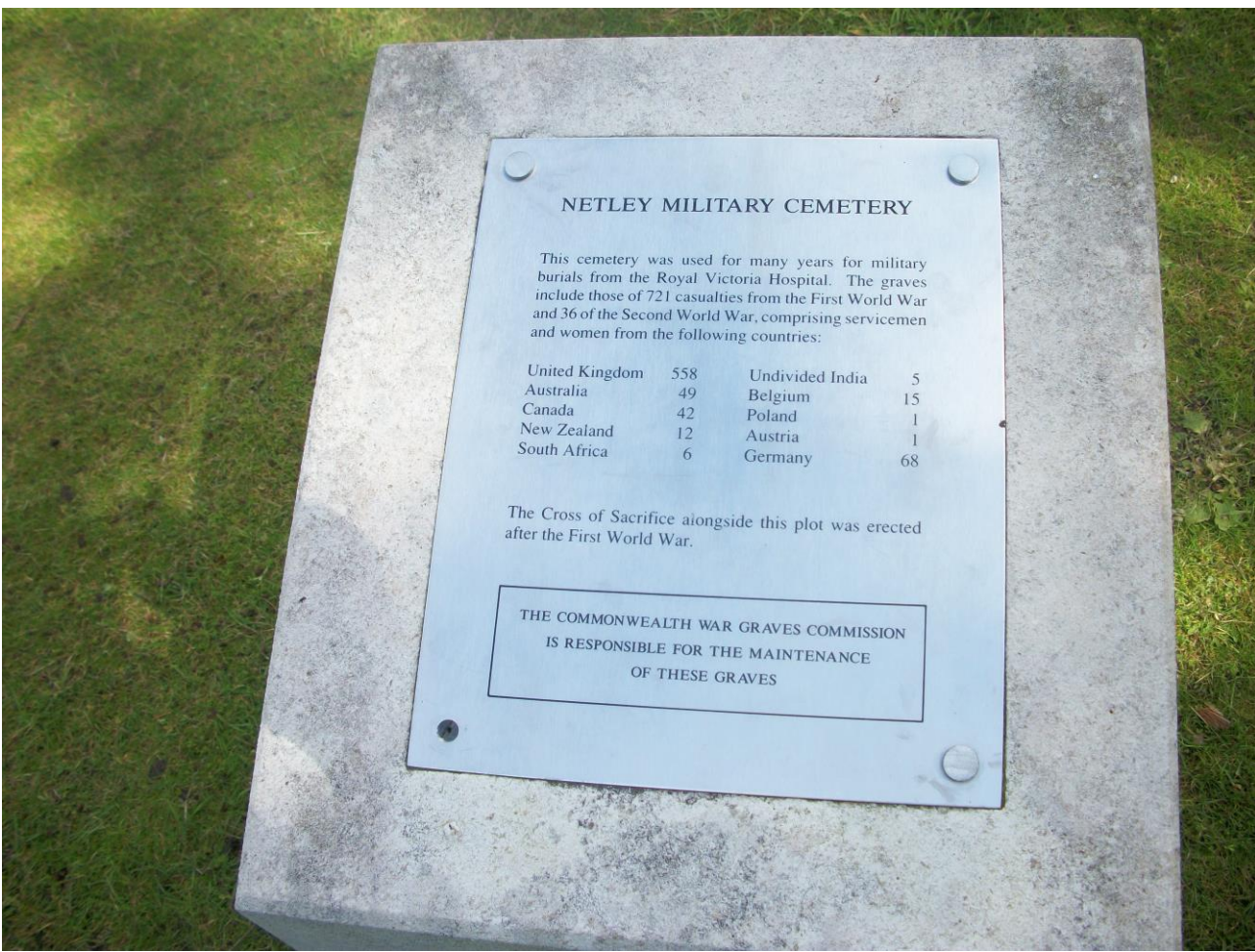
Netley Military Cemetery, Hampshire