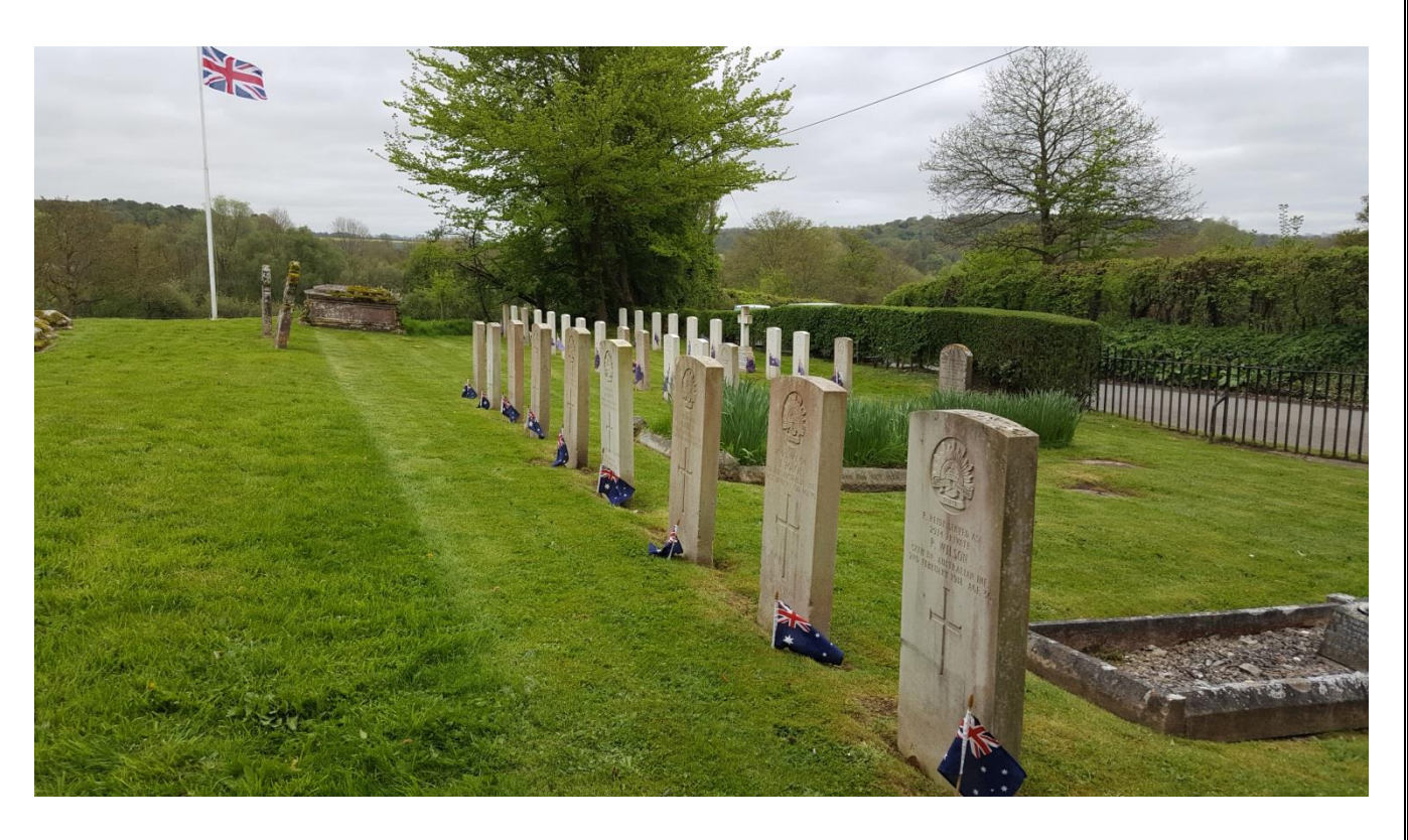
St. Edith's Churchyard, Baverstock