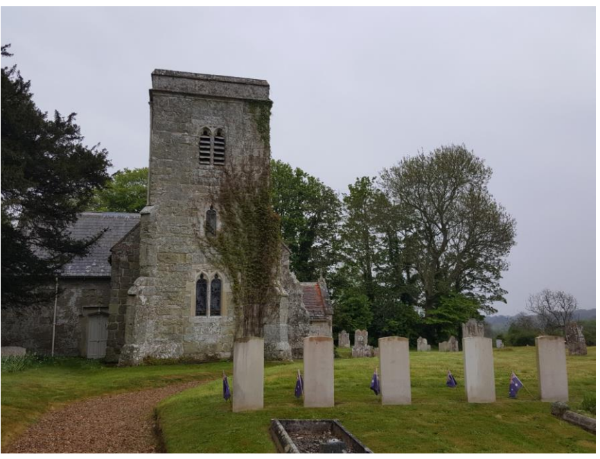
St. Edith's Churchyard, Baverstock

St. Edith's Churchyard, Baverstock contains 32 World War 1 War Graves – 3 London Regiment Graves in the southwest corner & 29 Australian War Graves.