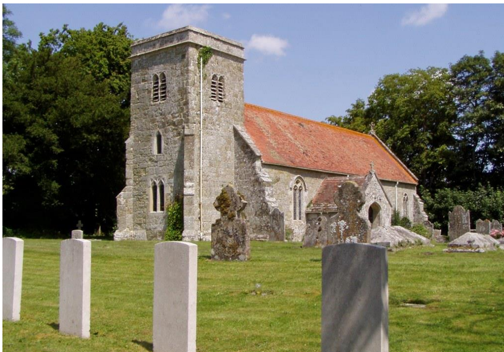
St. Edith's Churchyard, Baverstock, Wiltshire.