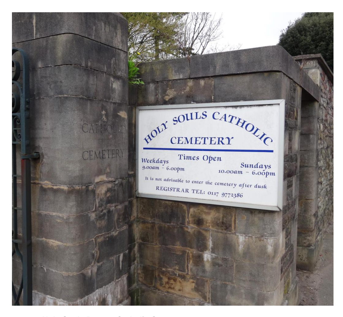
Holy Souls Roman Catholic Cemetery