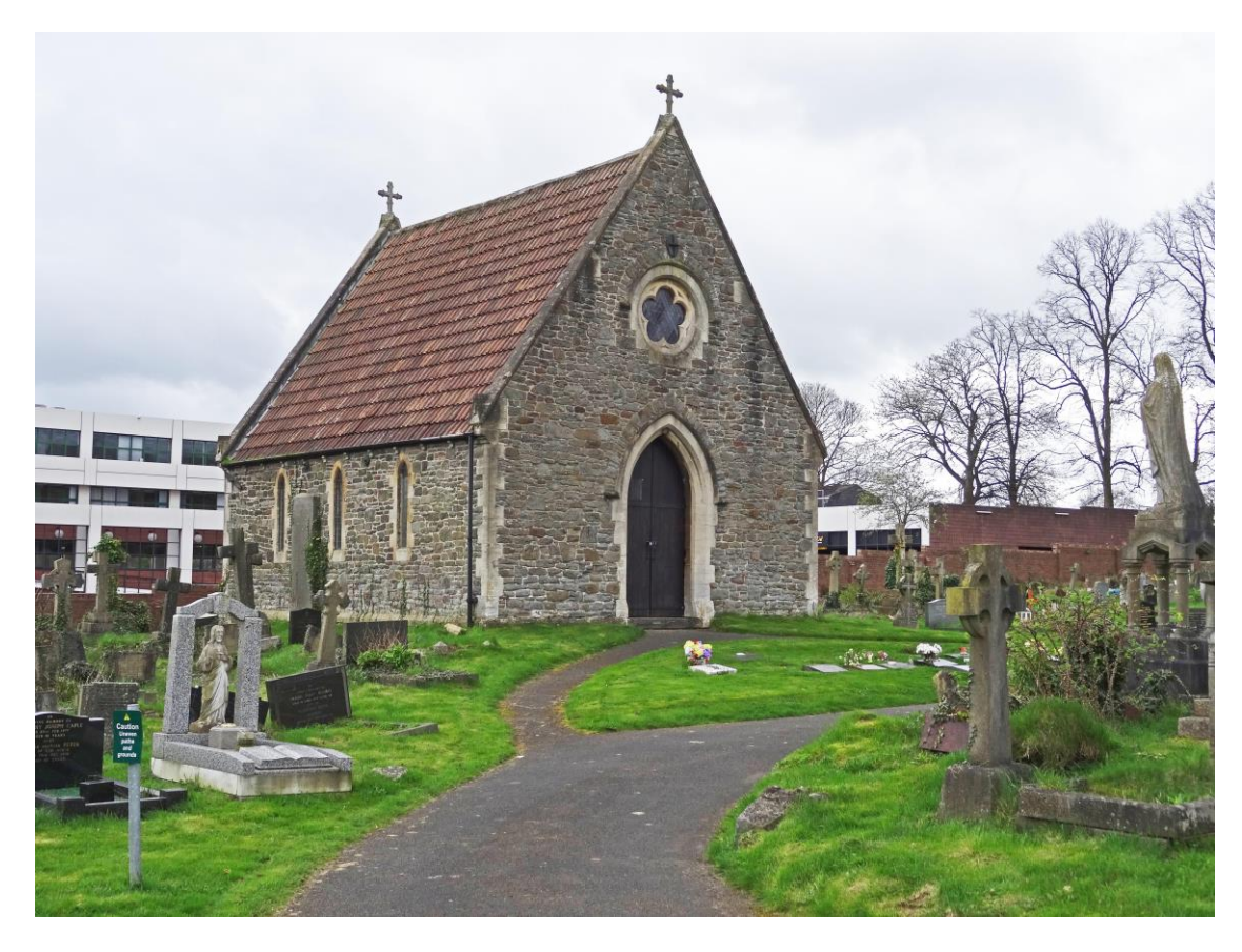
Holy Souls Roman Catholic Cemetery